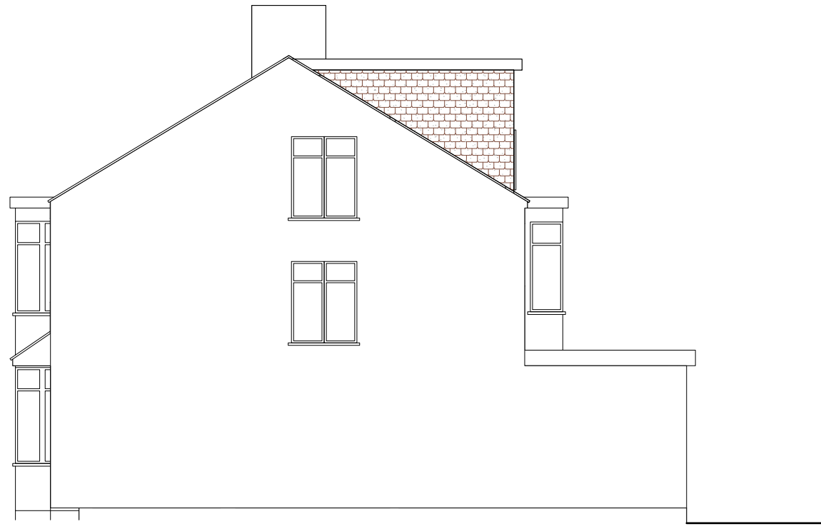
1 EXISTING SIDE ELEVATION PL-001 SCALE@A1 1:50 SCALE@A3 1:100