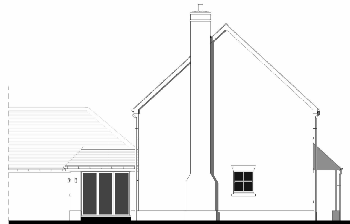
Left Flank Elevation