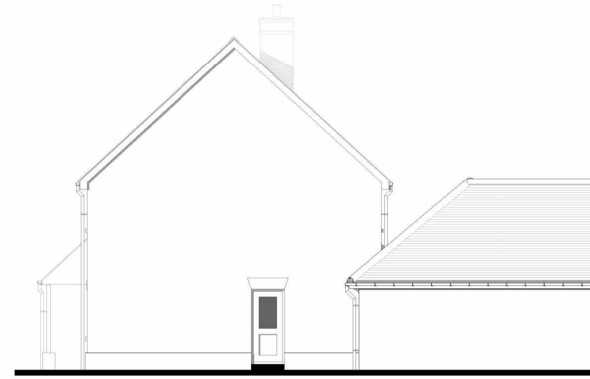
Right Flank Elevation