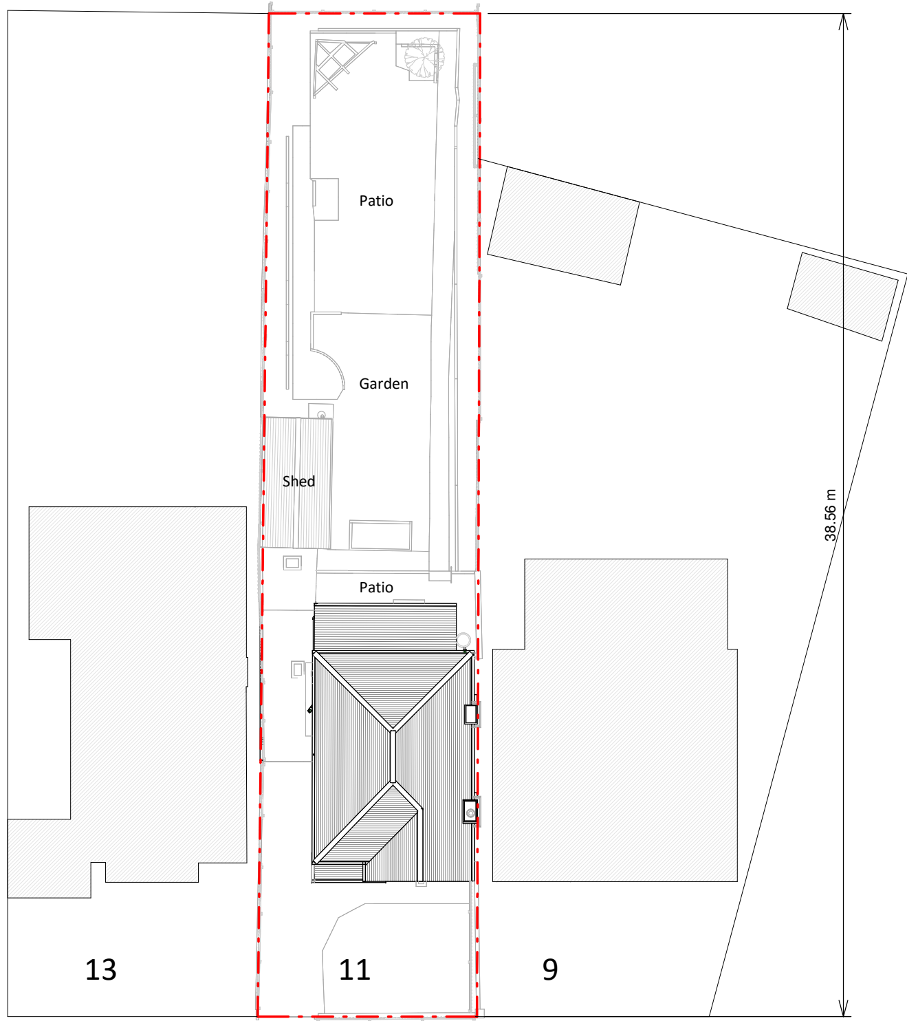
Existing Block Plan