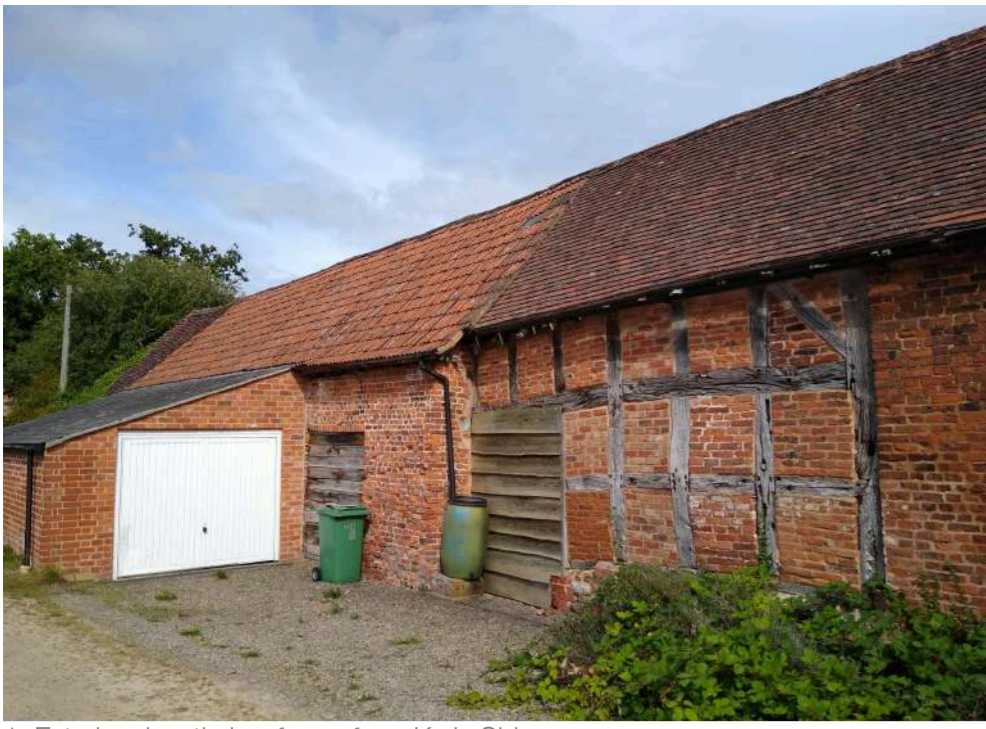
1. Exterior view timber frame from Kyrle Side