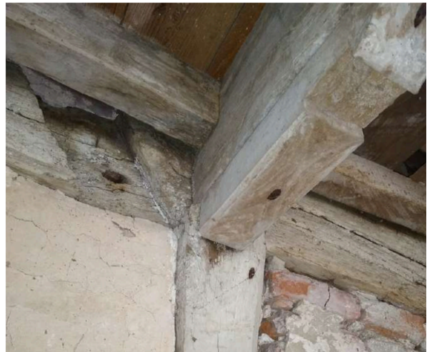
16. Interior timber frame detail beam end