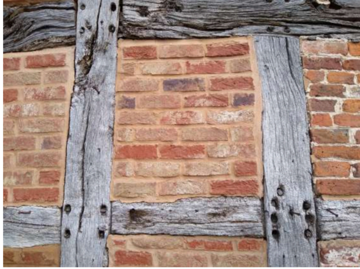
7. Exterior view timber frame detail mid panel e