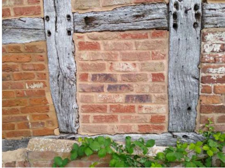
11. Exterior view timber frame detail bottom middle panel f