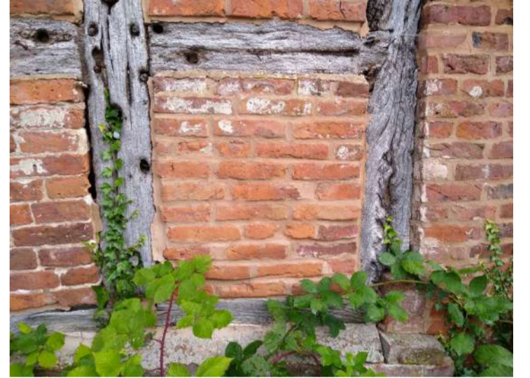
13. Exterior view timber frame detail bottom panels b far right