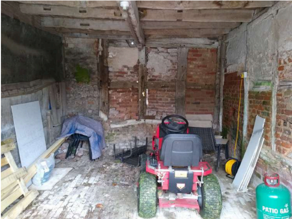
14. Interior view timber frame from Barn