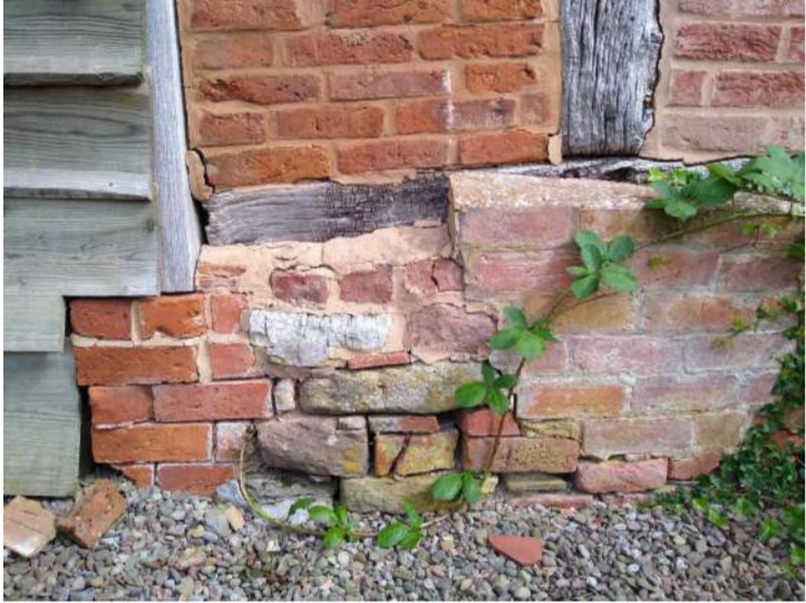
10. Exterior view timber frame detail bottom panel h left