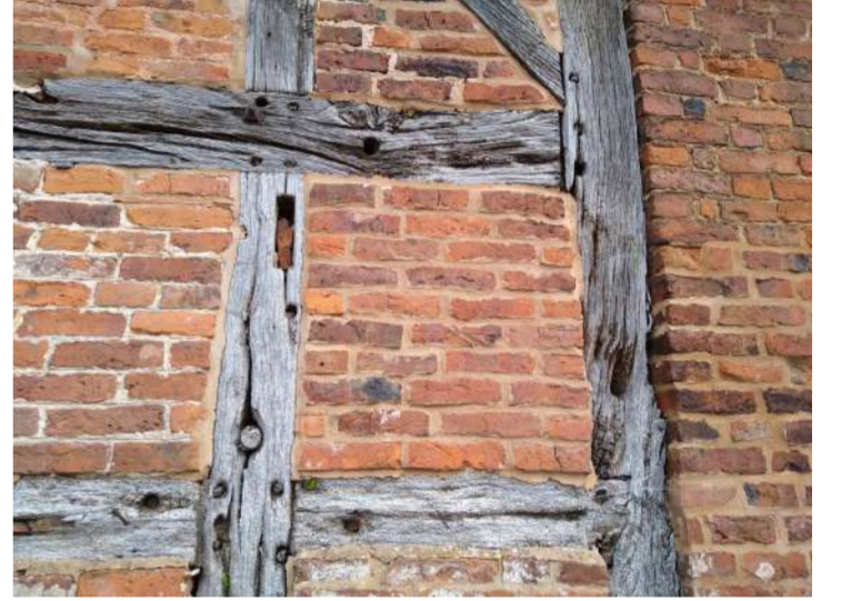
9. Exterior view timber frame detail mid panel a far right