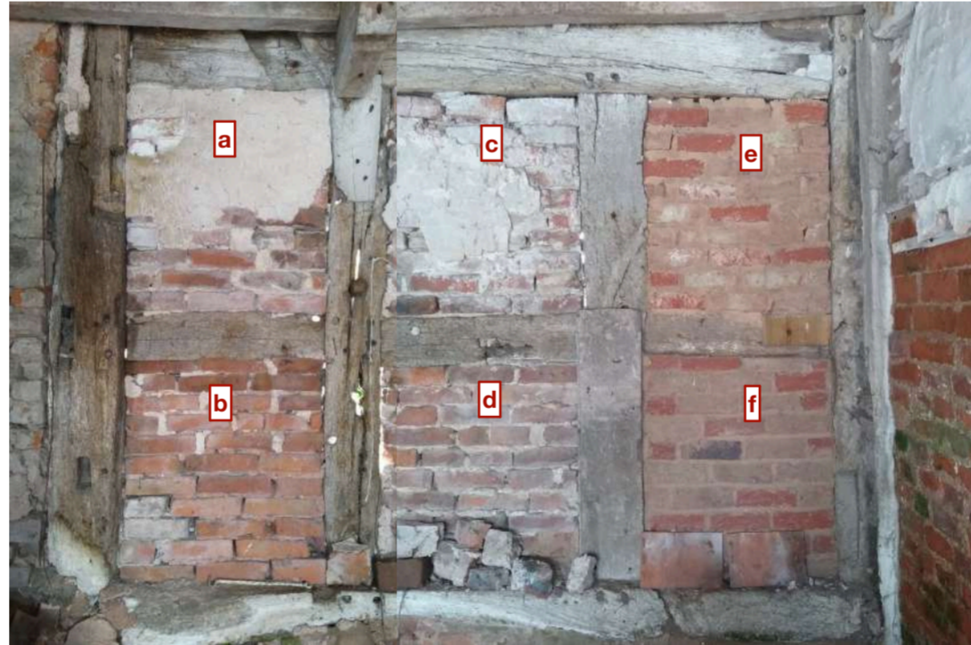
15. Interior timber frame from Barn