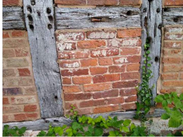
12. Exterior view timber frame detail bottom middle panel d