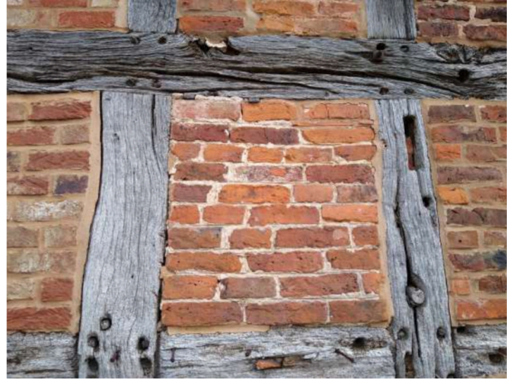
8. Exterior view timber frame detail middle panel c