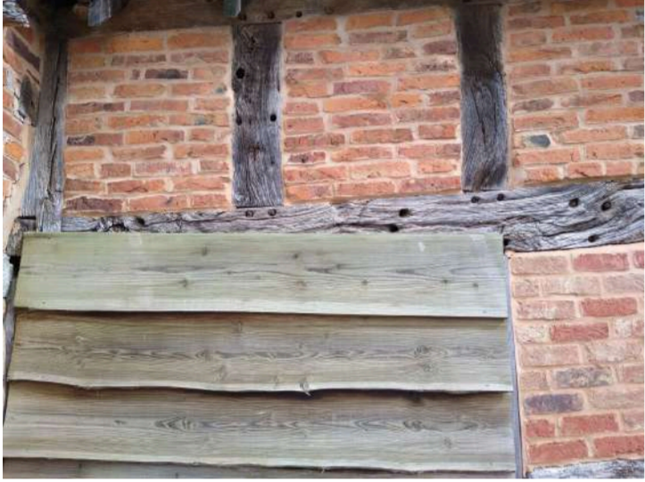
6. Exterior view timber frame detail top panels p and o far left