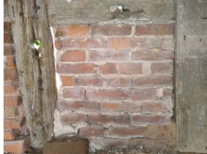
18. Interior timber frame detail panel d from Barn