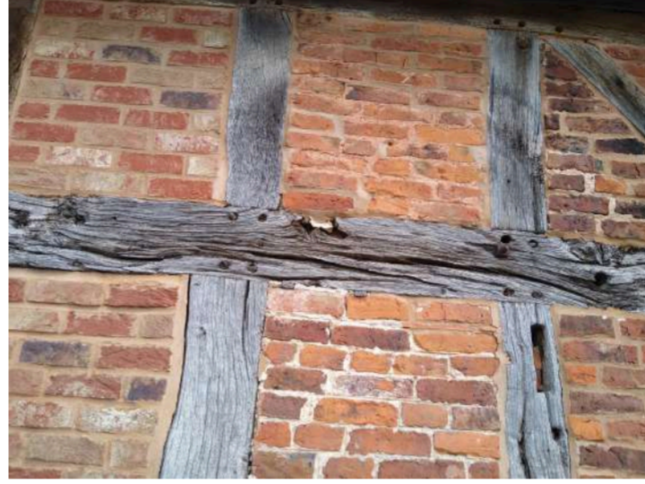
4. Exterior view timber frame detail top panel l