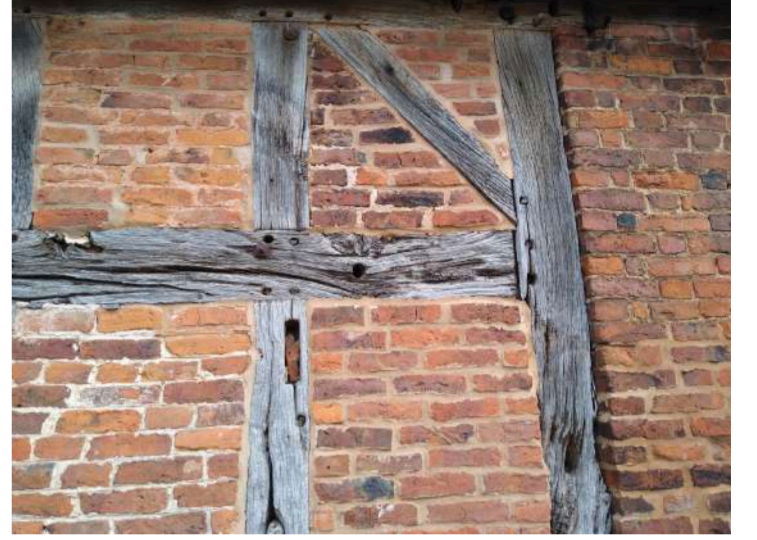
5. Exterior view timber frame detail top panels j and k