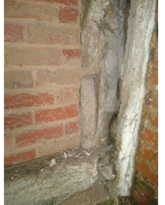
19. Timber frame detail panel f from Barn

The White House, Dymock, Gloucestershire GL18 2AQ