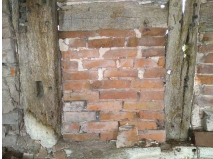
17. Interior timber frame detail panel b from Barn