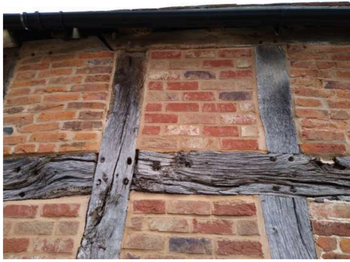
3. Exterior view timber frame detail top panel m