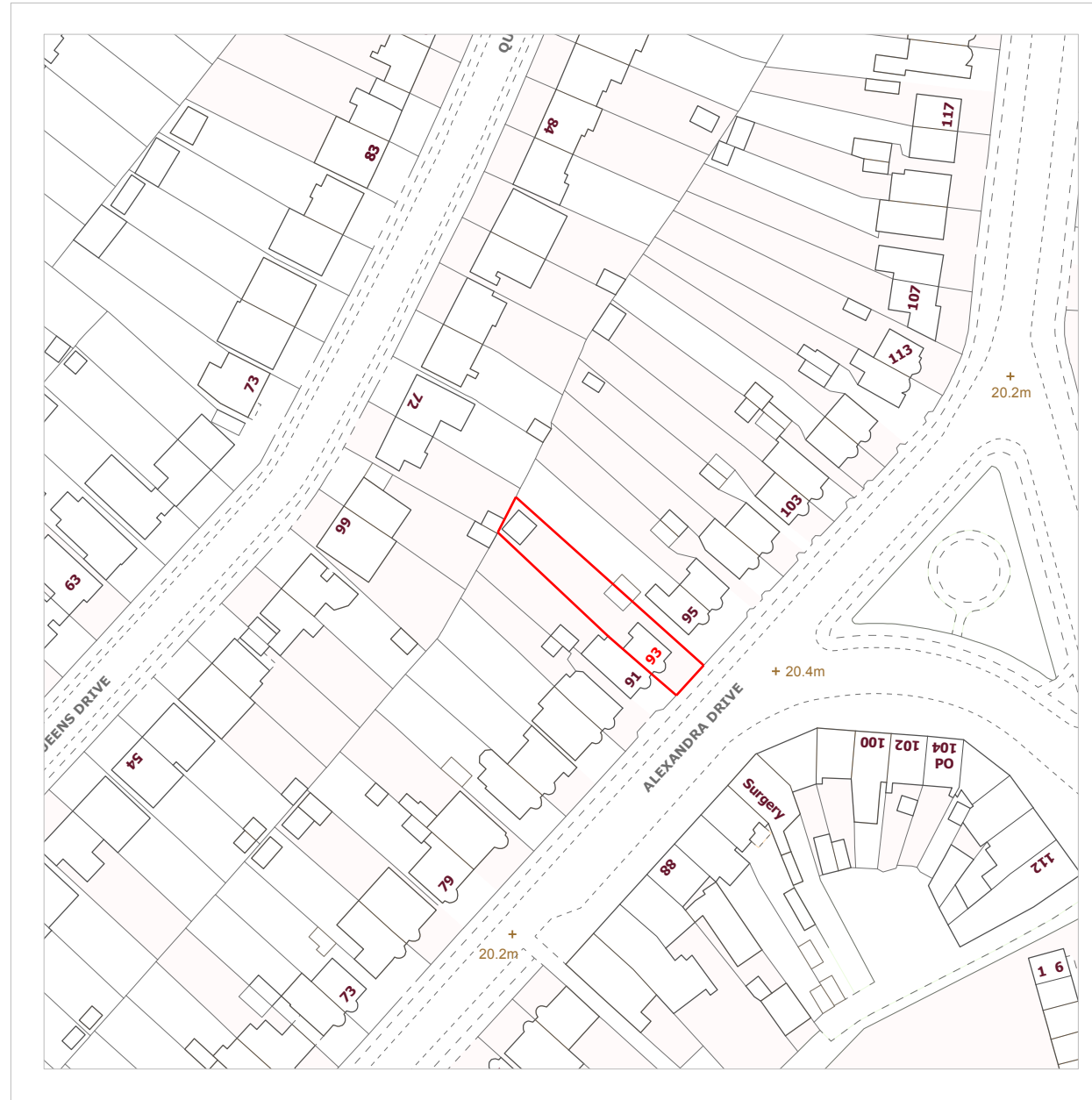
EXISTING LOCATION PLAN