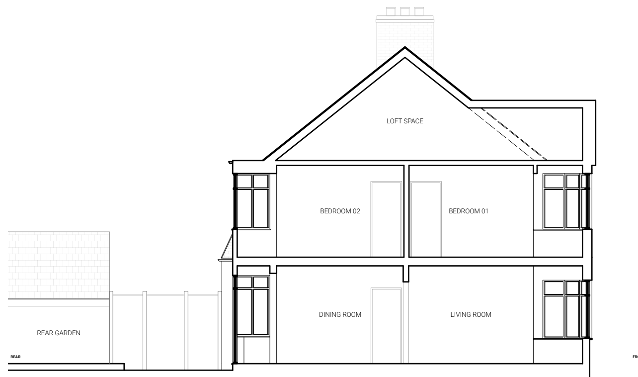
EAST SECTIONAL ELEVATION