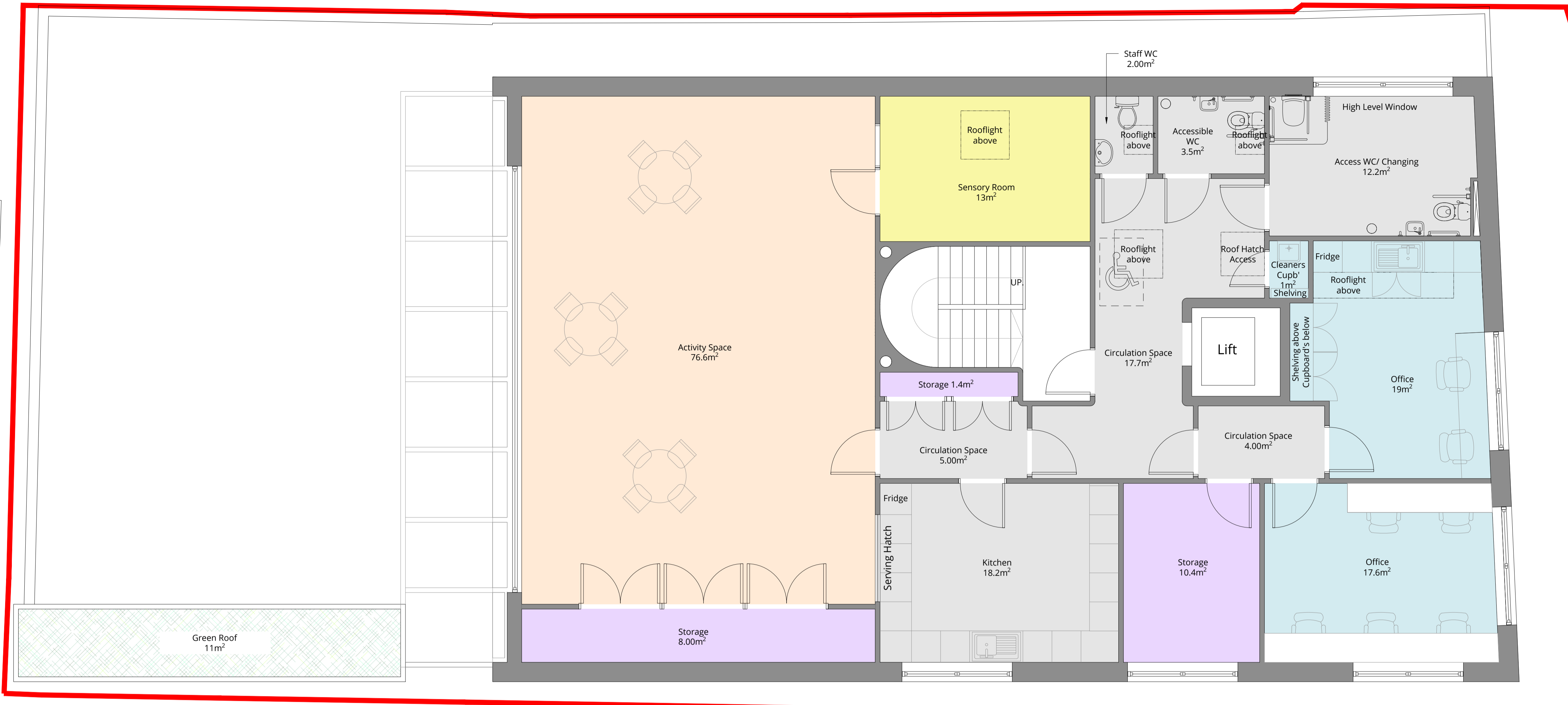
Proposed First Floor Plan Scale 1:50