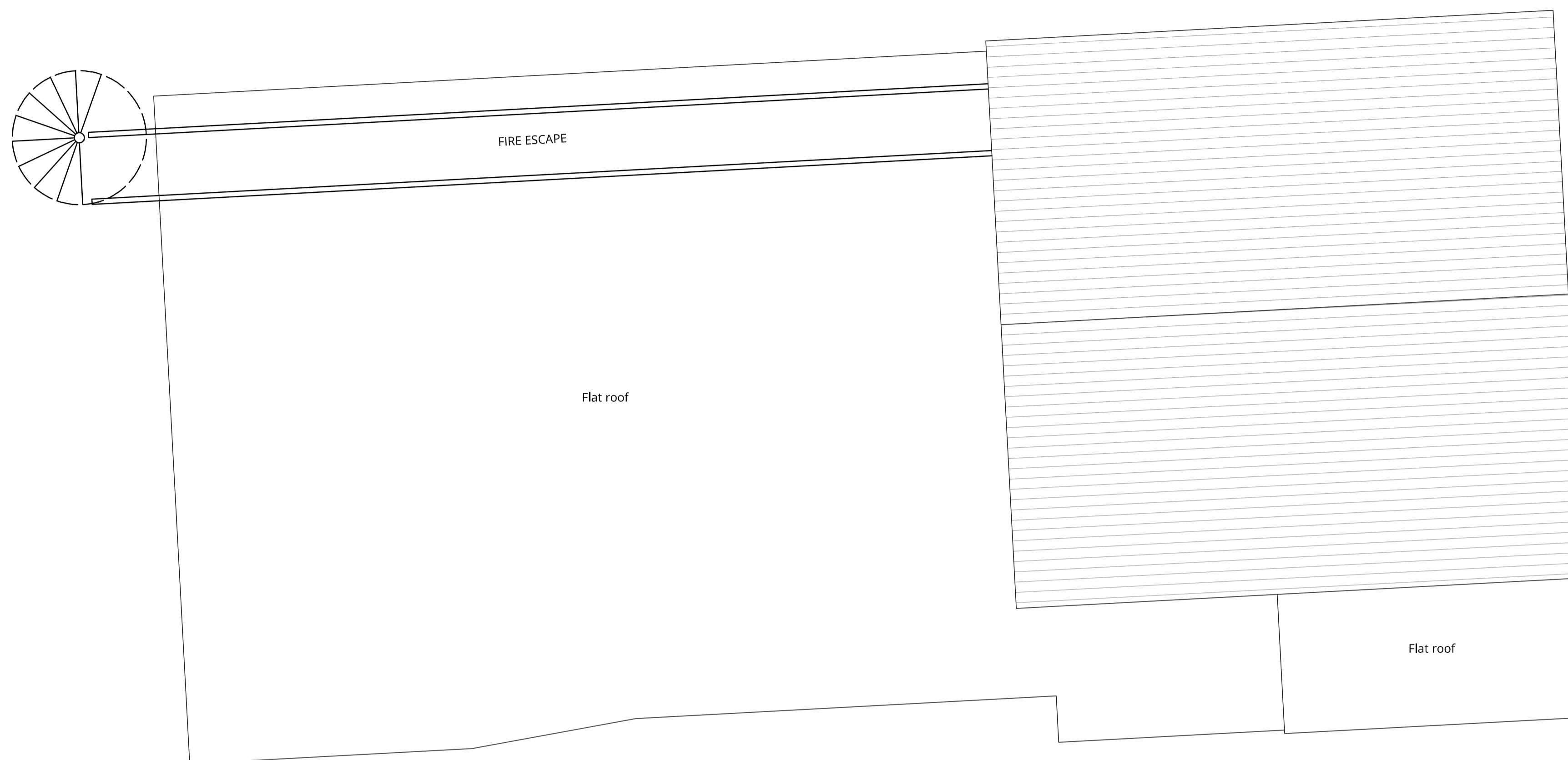
Existing Roof Plan Scale - 1:50