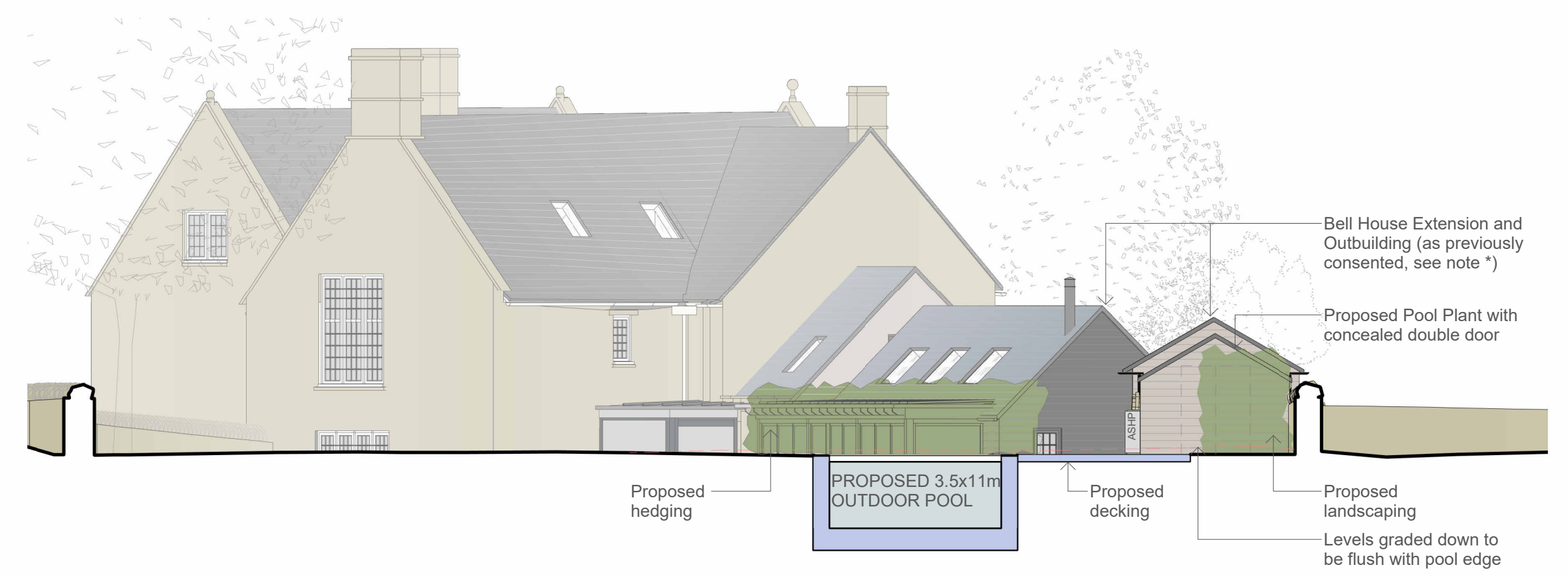
Outdoor Pool Section B