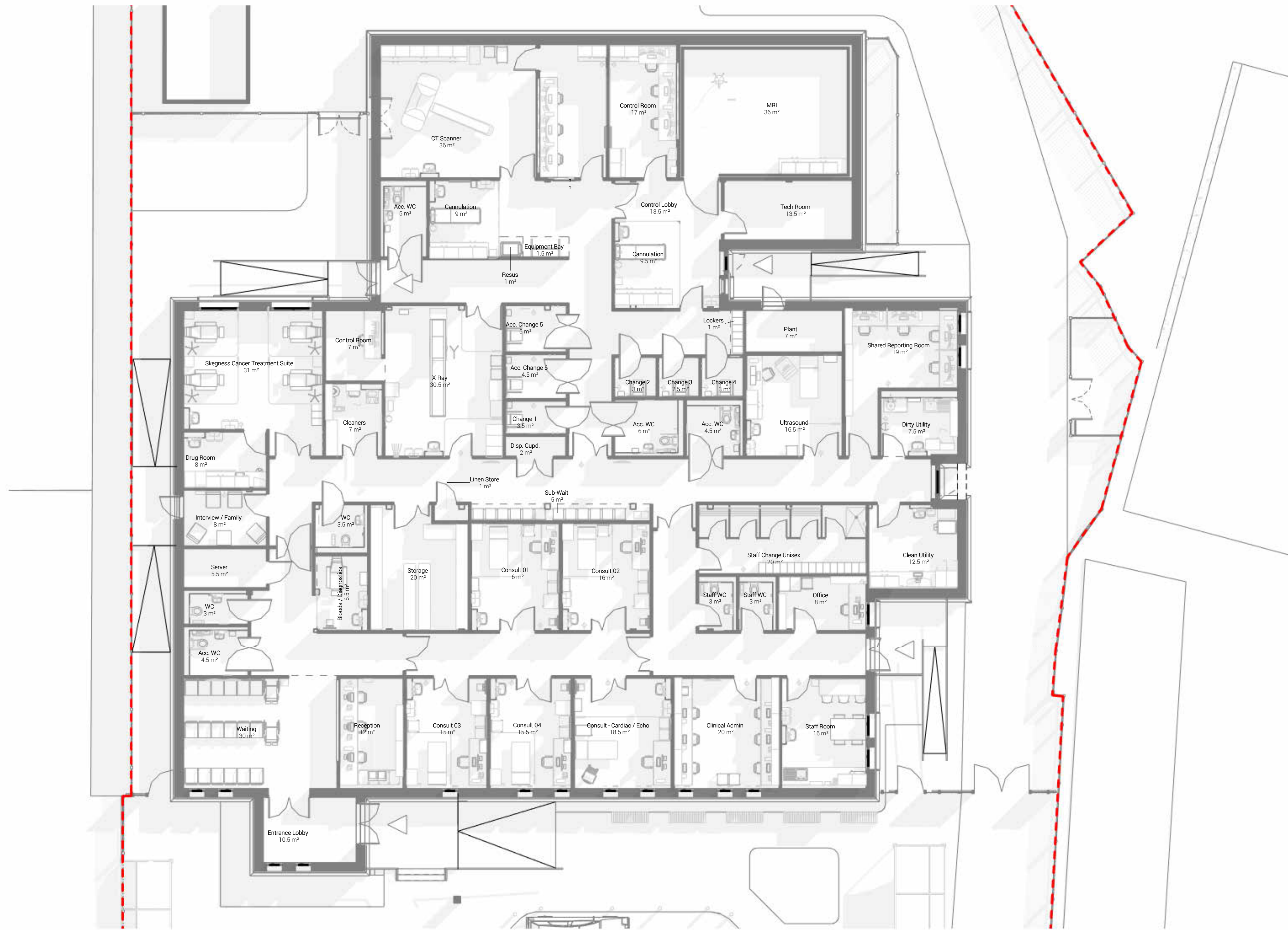
Level 00 - Proposed GA Plan 1:100