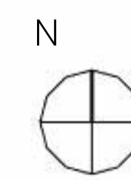
Proposed Location Plan 1:500