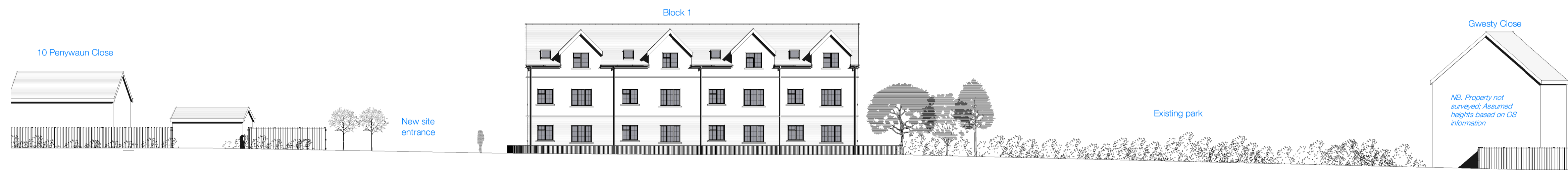
Proposed context elevation 1 : 200