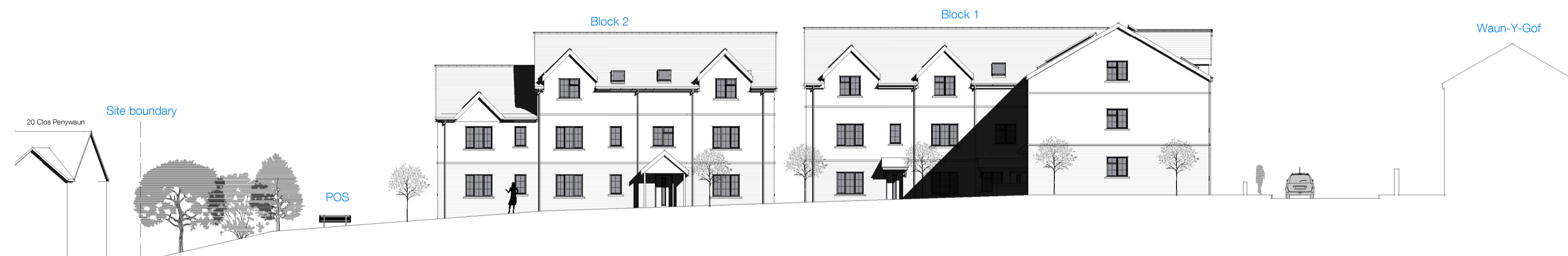
Indicative site section 1 : 200