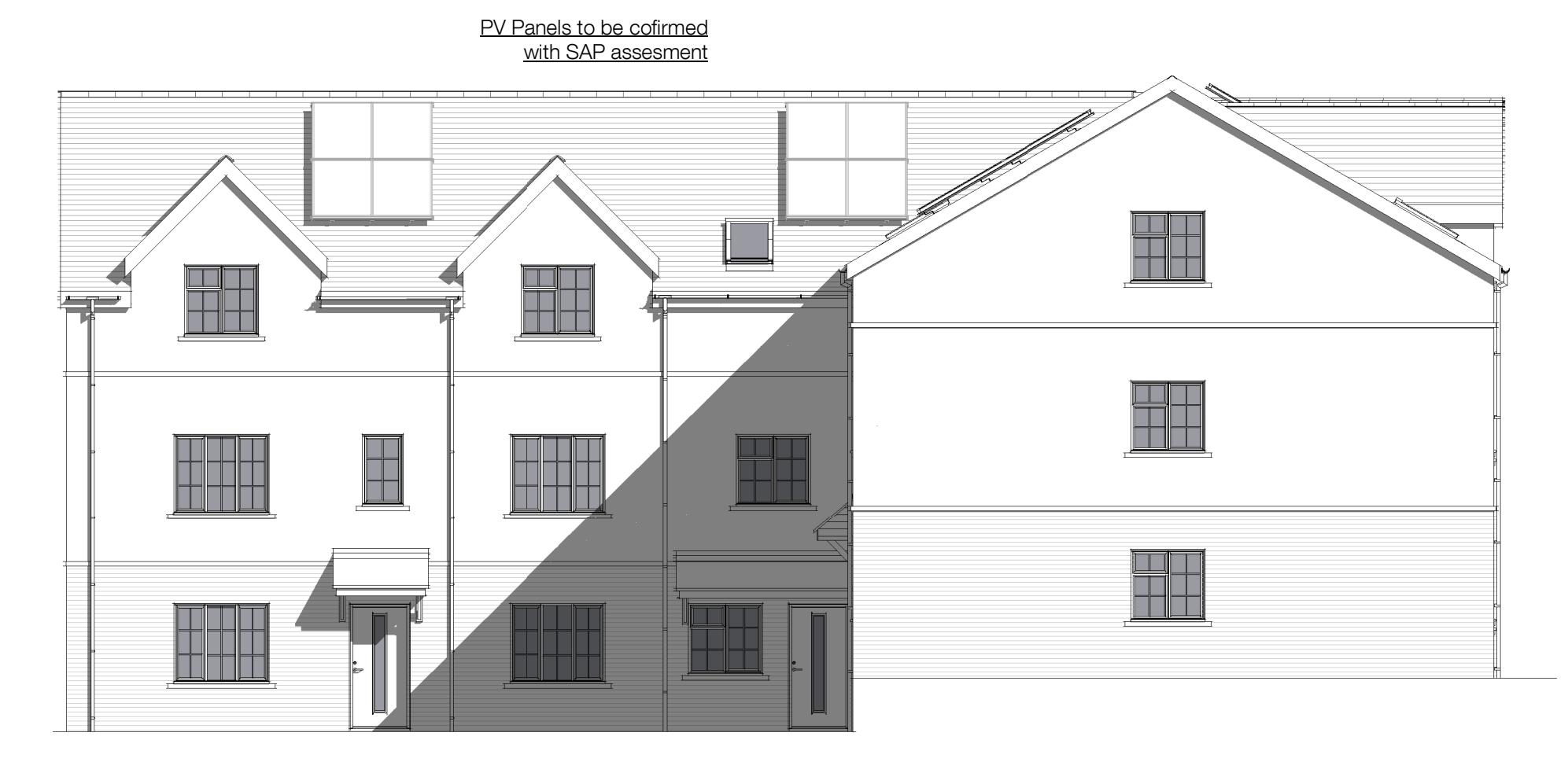
Block 1 - Side elevation 1 1:100