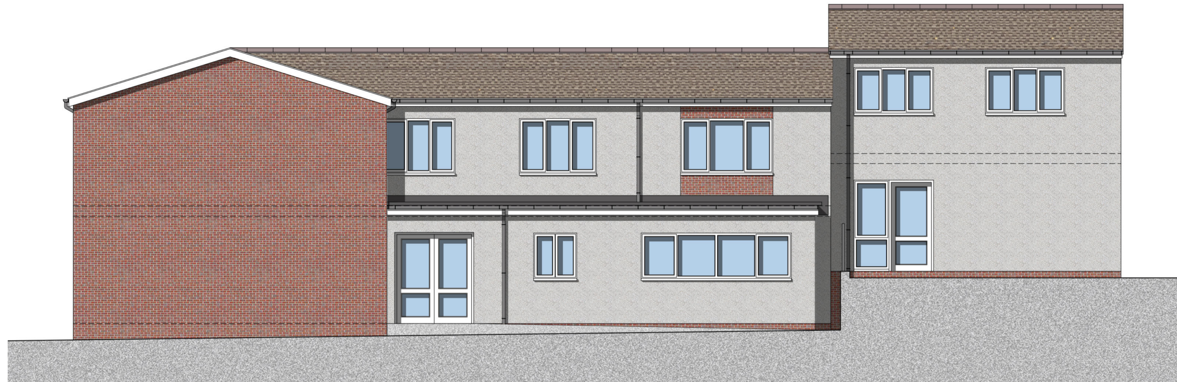
Existing South West Elevation

Notes :- DO NOT SCALE FROM THIS DRAWING ANY DISCREPANCIES TO BE REPORTED TO THE CONTRACT ADMINISTRATOR CONTRACTOR TO CHECK DIMENSIONS ON SITE DRAWINGS ISSUED WITHOUT STATUS ARE DRAFT ONLY