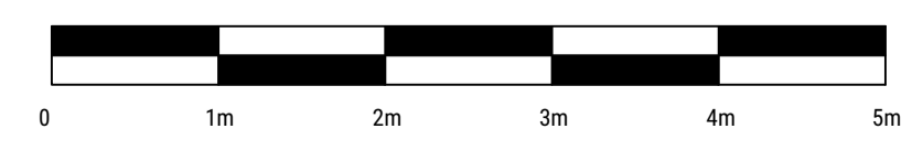
SCALE BAR 1:50