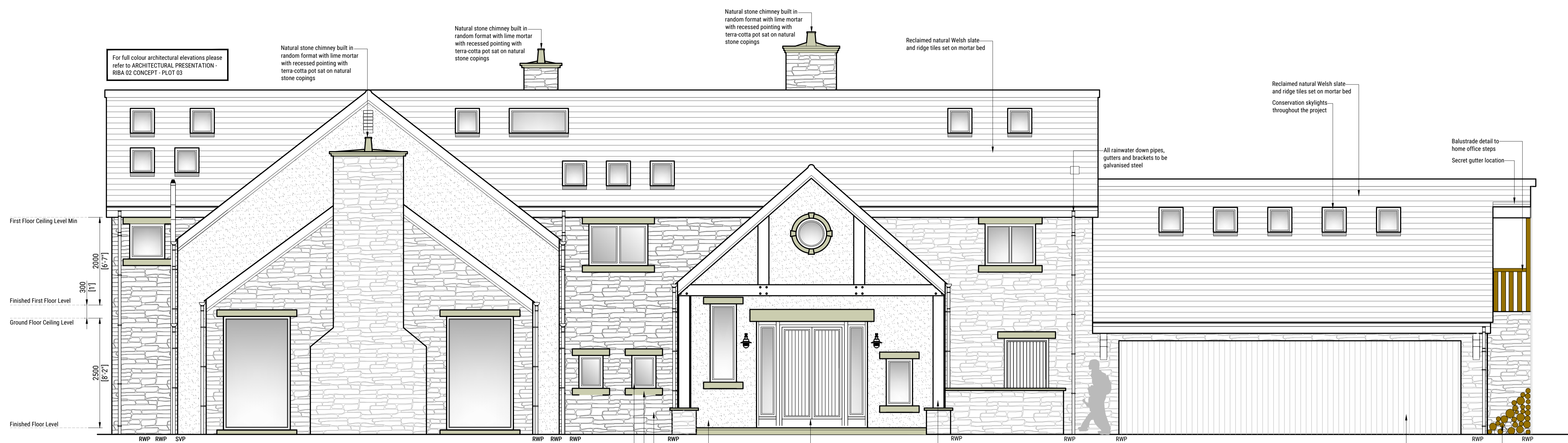
Front East Elevation, as 'Proposed' Scale 1:50

Drawing Registry Rev. Date Description Author Checked