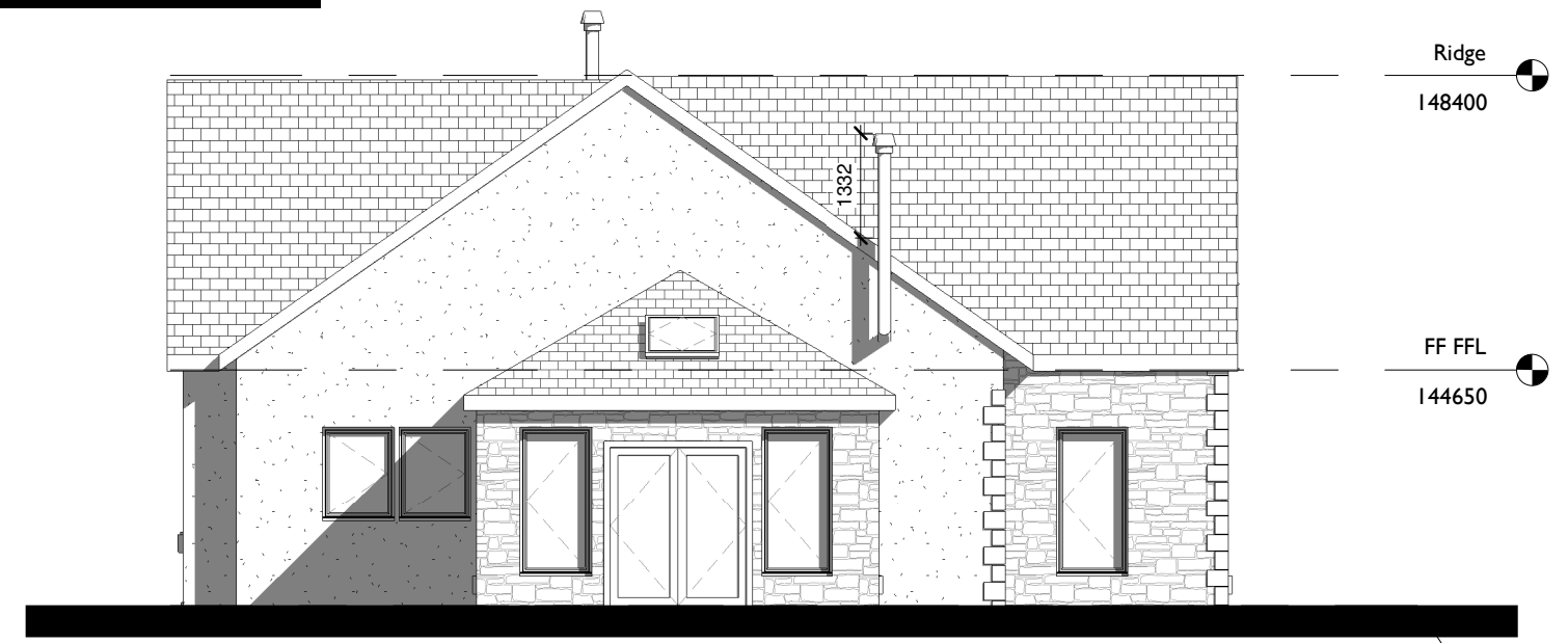
South Elevation 1 : 100