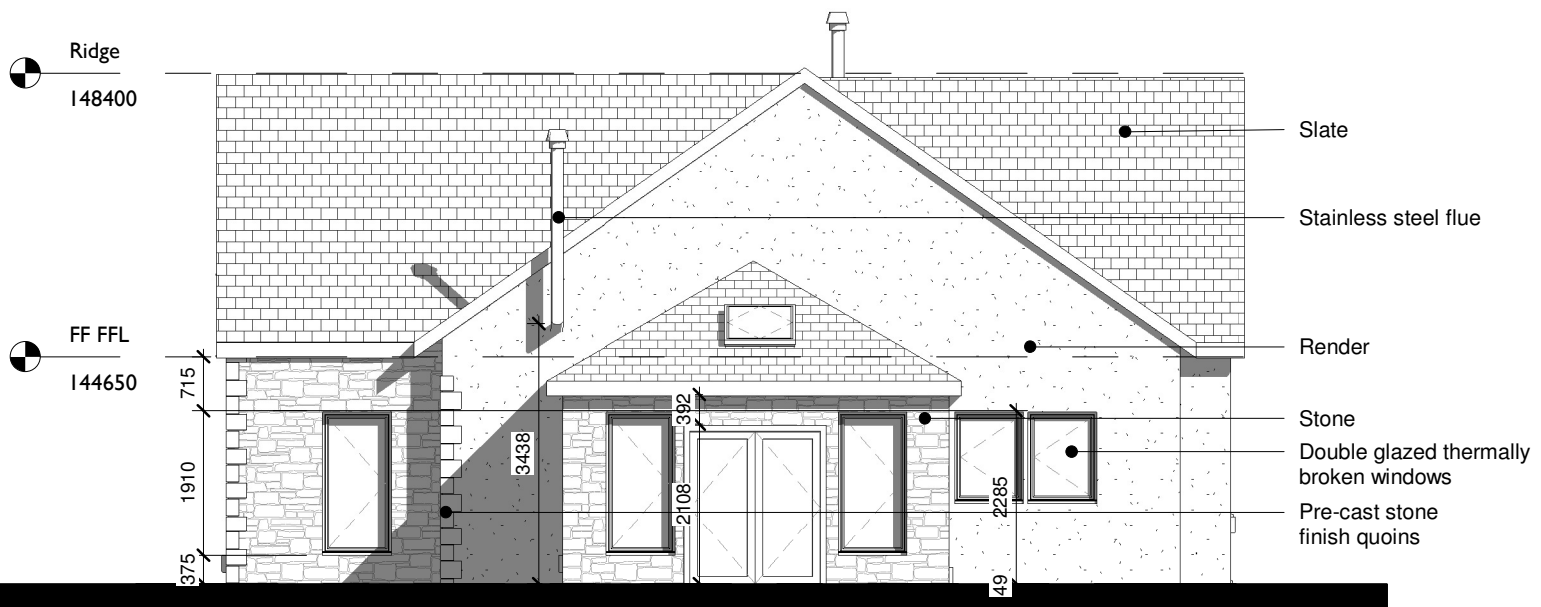
North Elevation 1 : 100

This drawing is to be read in conjunction with all related drawings. All dimensions must be checked and verified on site before commencing any work or producing shop drawings. The originator should be notified immediately of any discrepancy. This drawing is copyright and remains the property of AMP Architects.