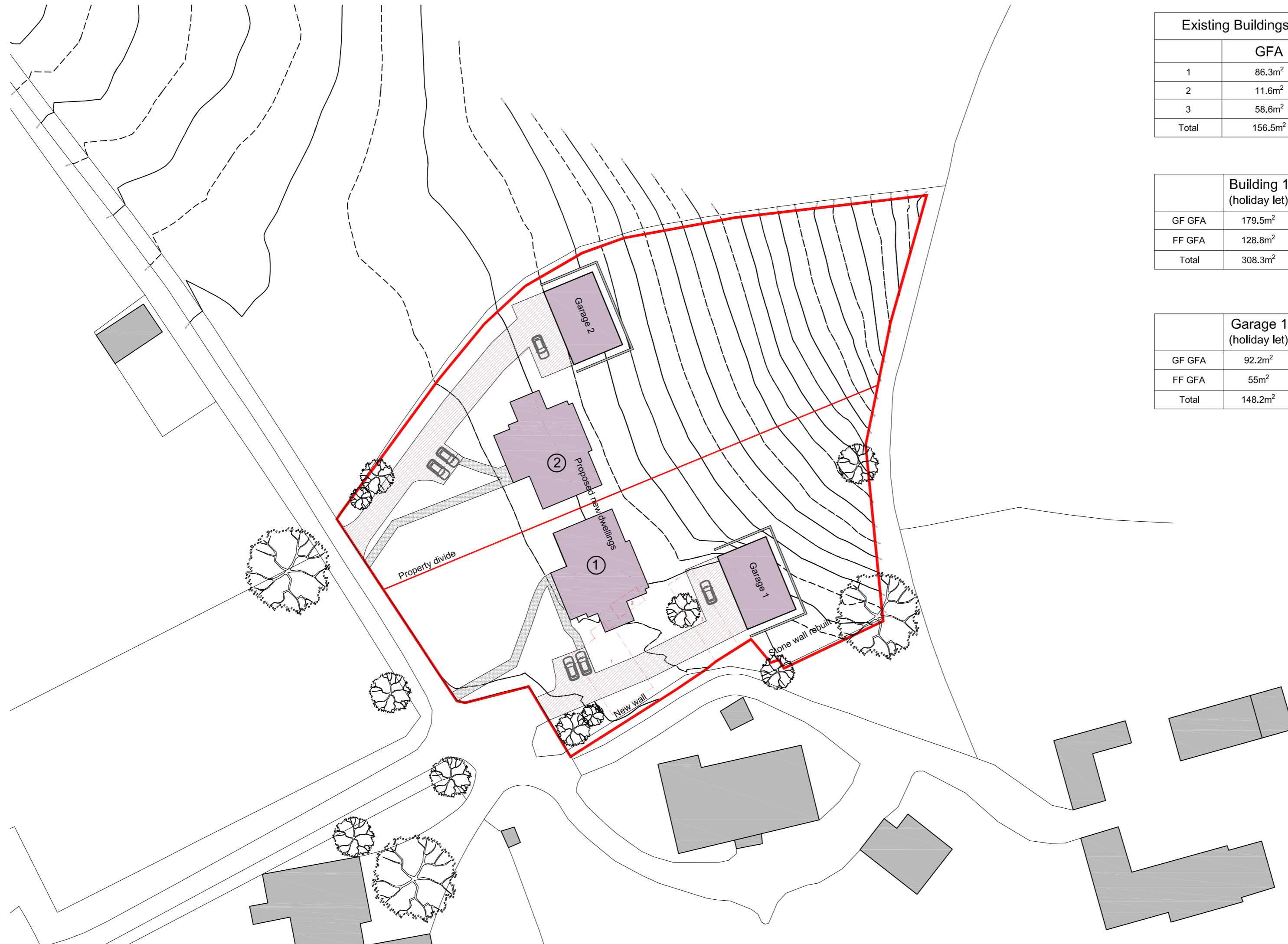
Proposed Site Plan Scale 1:500 @ A2