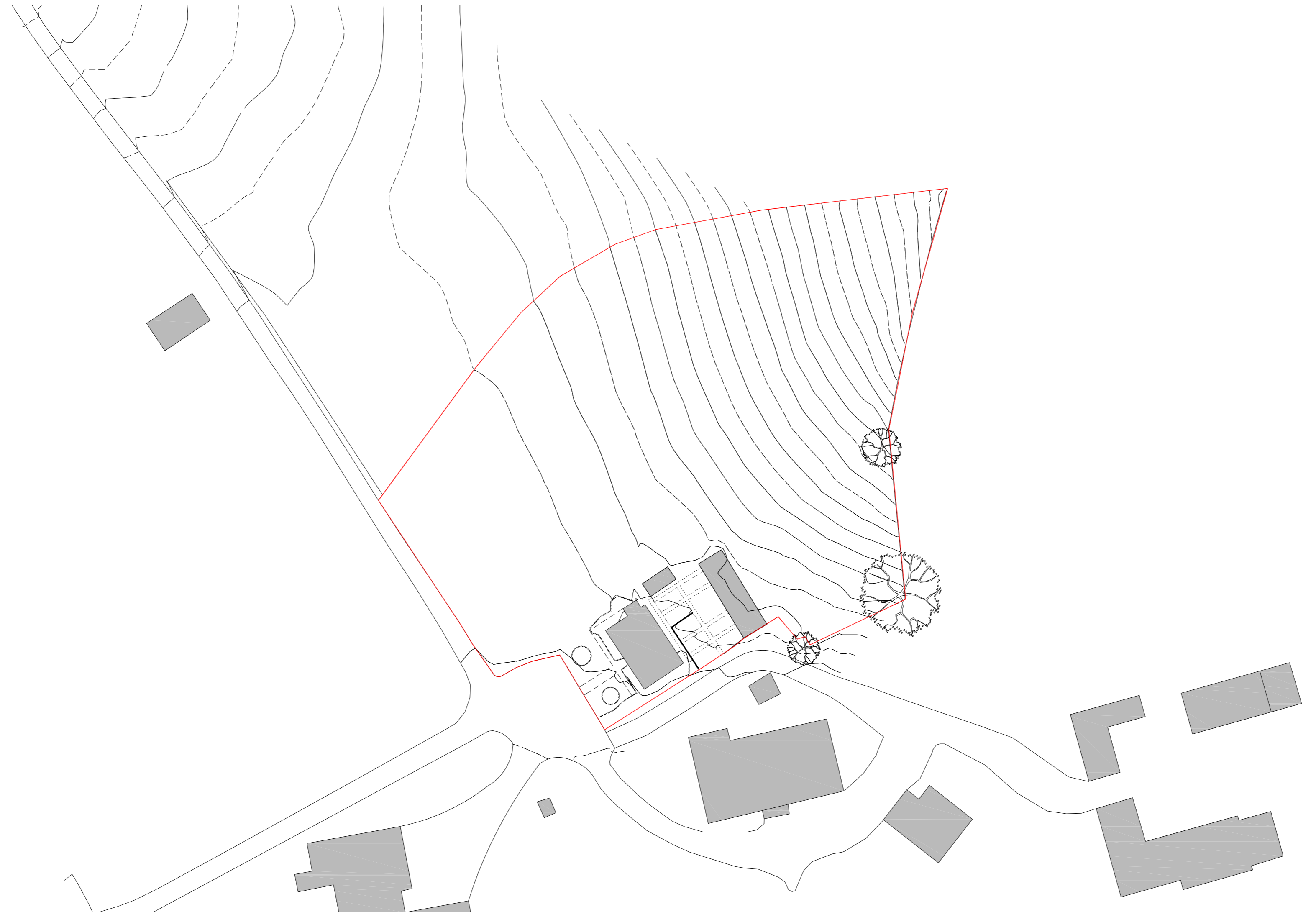
Existing Site Plan Scale 1:500 @ A2