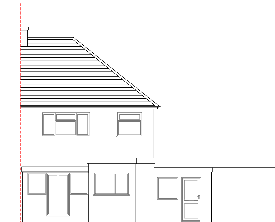
EXISTING REAR ELEVATION SCALE: 1:100