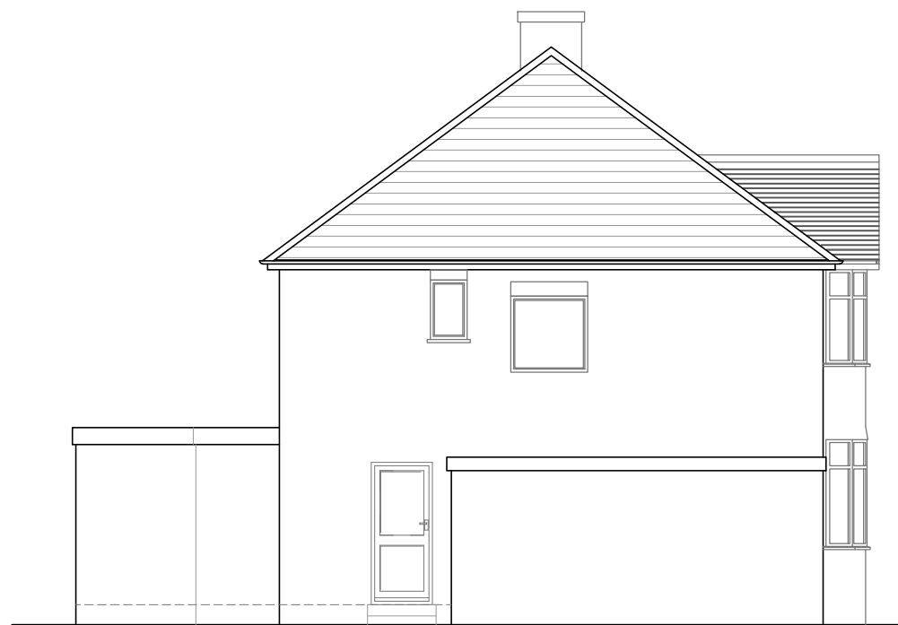
EXISTING SIDE ELEVATION SCALE: 1:100