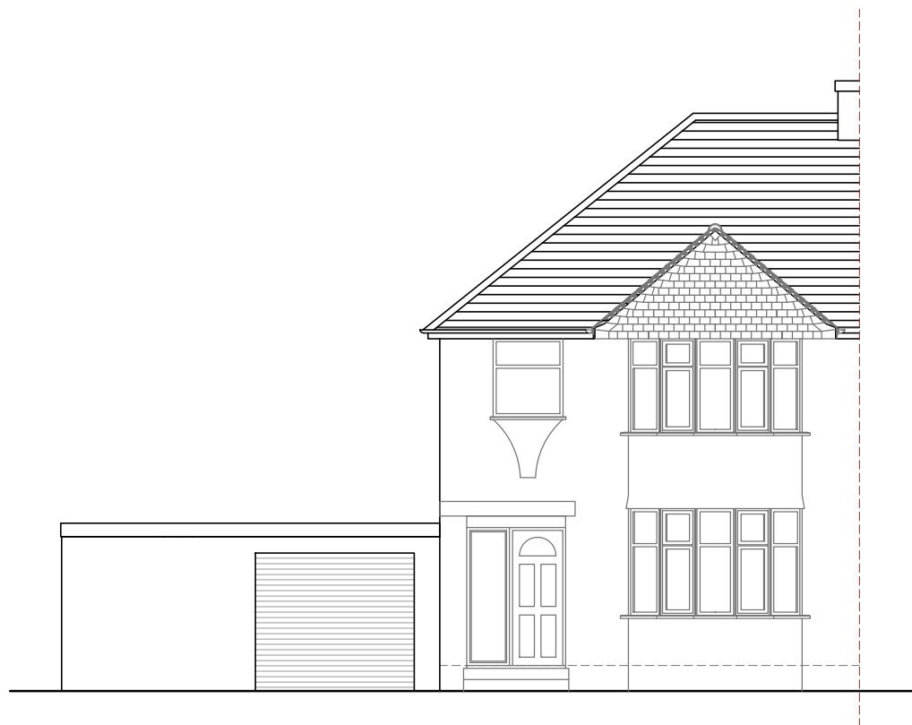
EXISTING FRONT ELEVATION SCALE: 1:100

This drawing is the property of Orb Property Planning Ltd and may not be reproduced, loaned or copied, in part or in full, without the prior written consent of Orb Property Planning Ltd. This drawing is not for construction purposes, unless otherwise stated. The Contractor is responsible for checking all dimensions before any work starts or any materials are ordered. Any discrepancies must be brought to the attention of Orb Property Planning Ltd immediately.