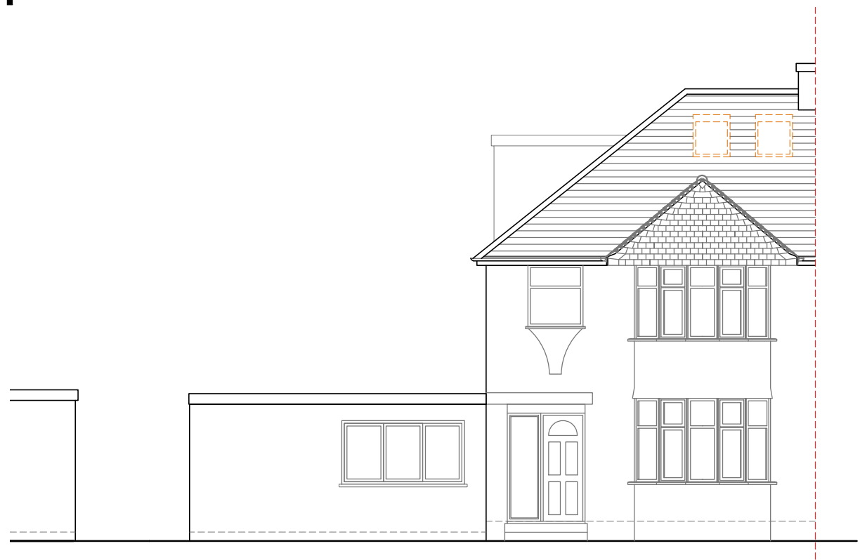
PROPOSED FRONT ELEVATION SCALE: 1:100

Scale - 1:100 This drawing is the property of Orb Property Planning Ltd and may not be reproduced, loaned or copied, in part or in full, without the prior written consent of Orb Property Planning Ltd. This drawing is not for construction purposes, unless otherwise stated. The Contractor is responsible for checking all dimensions before any work starts or any materials are ordered. Any discrepancies must be brought to the attention of Orb Property Planning Ltd immediately.