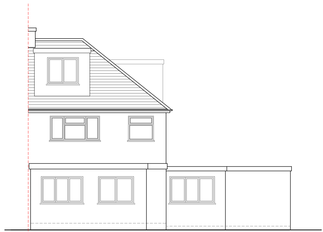
PROPOSED REAR ELEVATION SCALE: 1:100