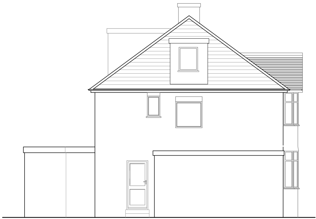
PROPOSED SIDE ELEVATION SCALE: 1:100