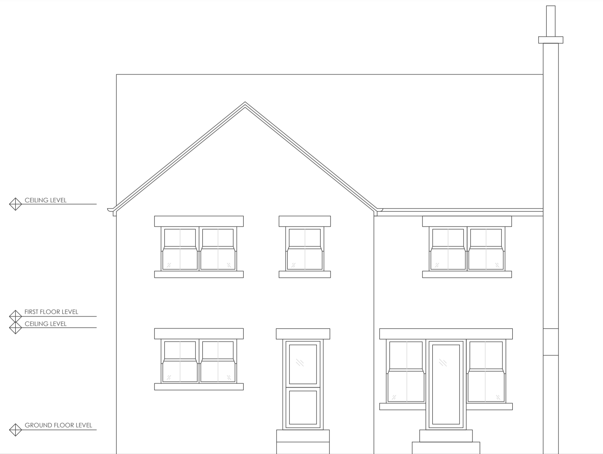
EXISTING REAR ELEVATION 1:50