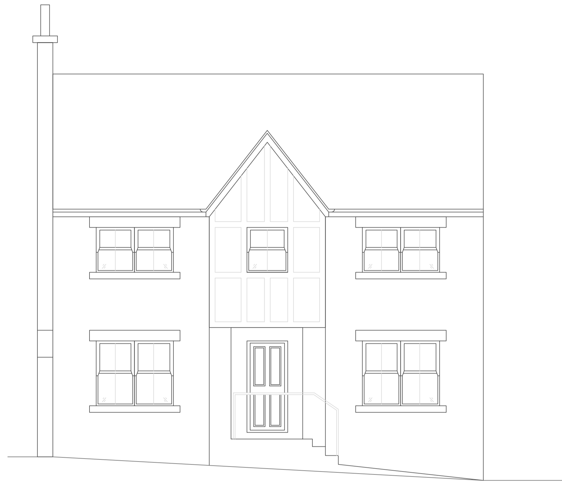
EXISTING FRONT ELEVATION 1:50