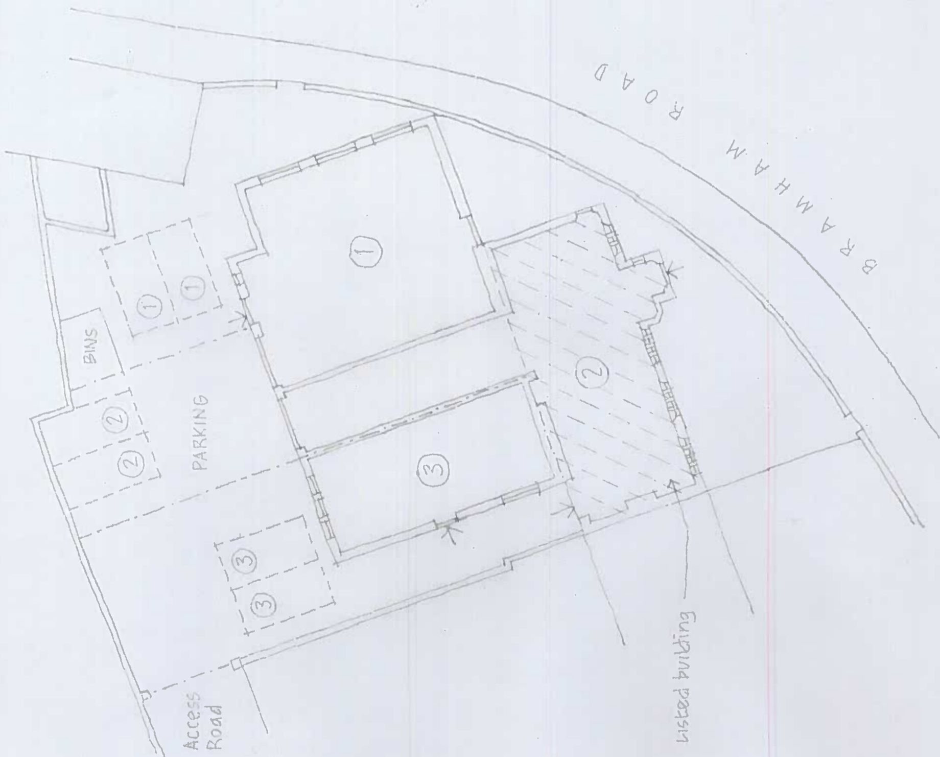
BLOCK PLAN 0 5 10 15M