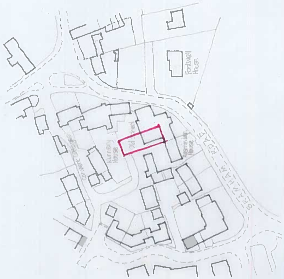
LOCATION PLAN 0 50M