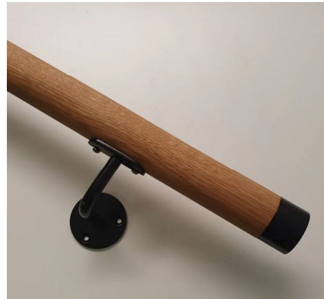
Oak mopstick handrail