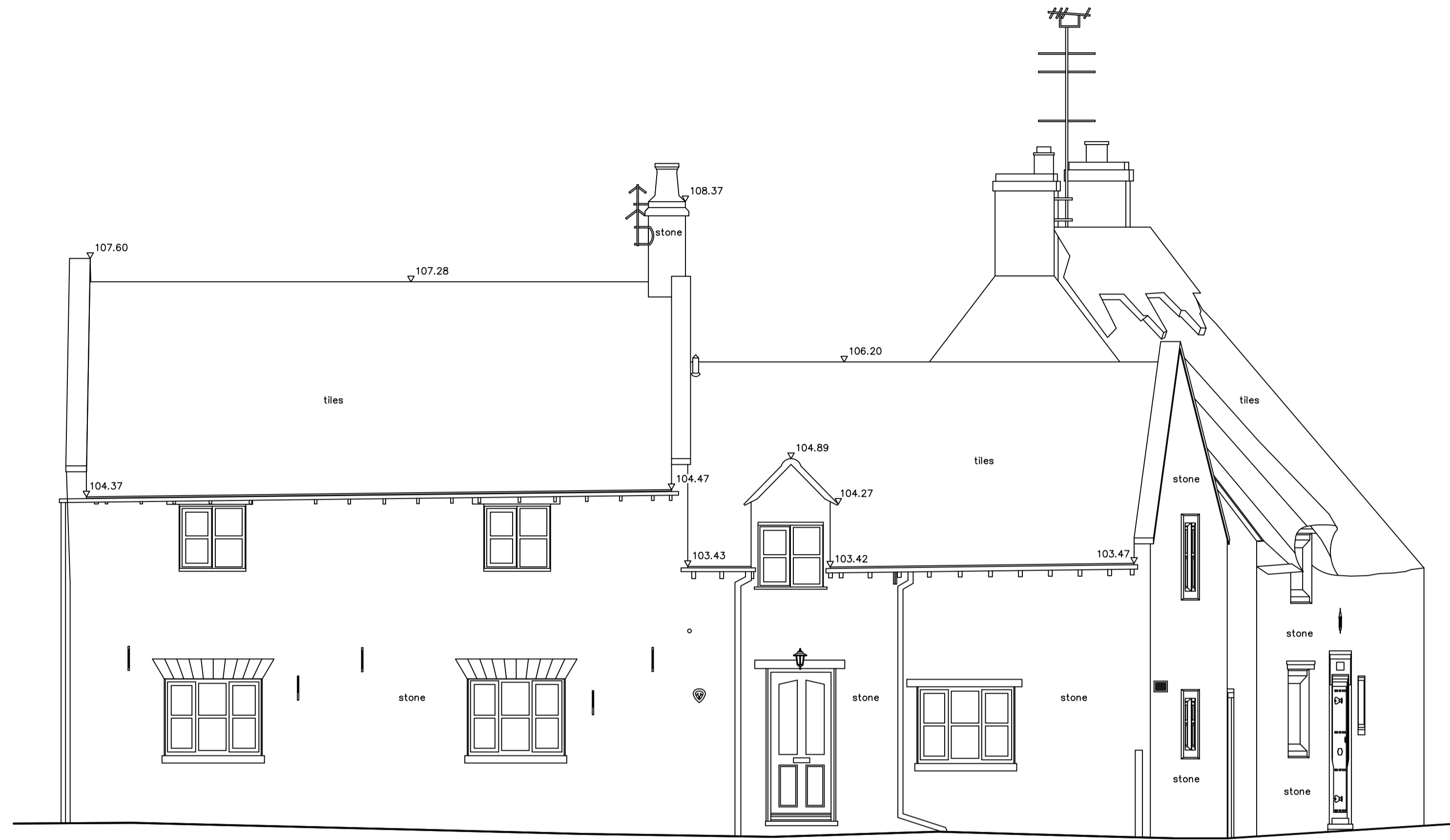
SOUTH-EAST ELEVATION A (97.00m A.D.)

This plot has been prepared with a scaling accuracy for a plot at a scale of 1/50 All levels are in metres and related to a local datum.