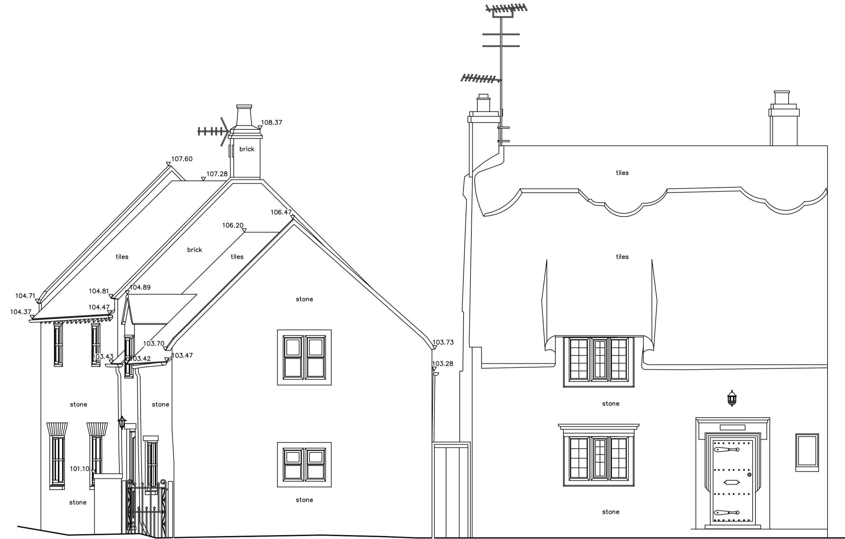
NORTH-EAST ELEVATION 2 (97.00m A.D.)

This plot has been prepared with a scaling accuracy for a plot at a scale of 1/50 All levels are in metres and related to a local datum.