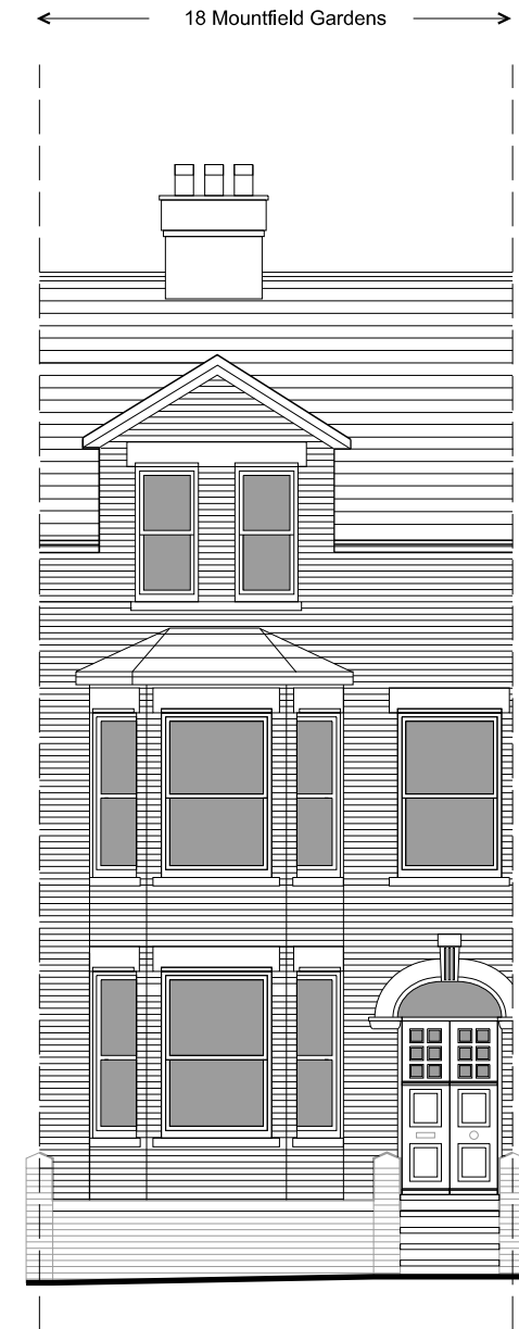
Existing Front Elevation (no change)