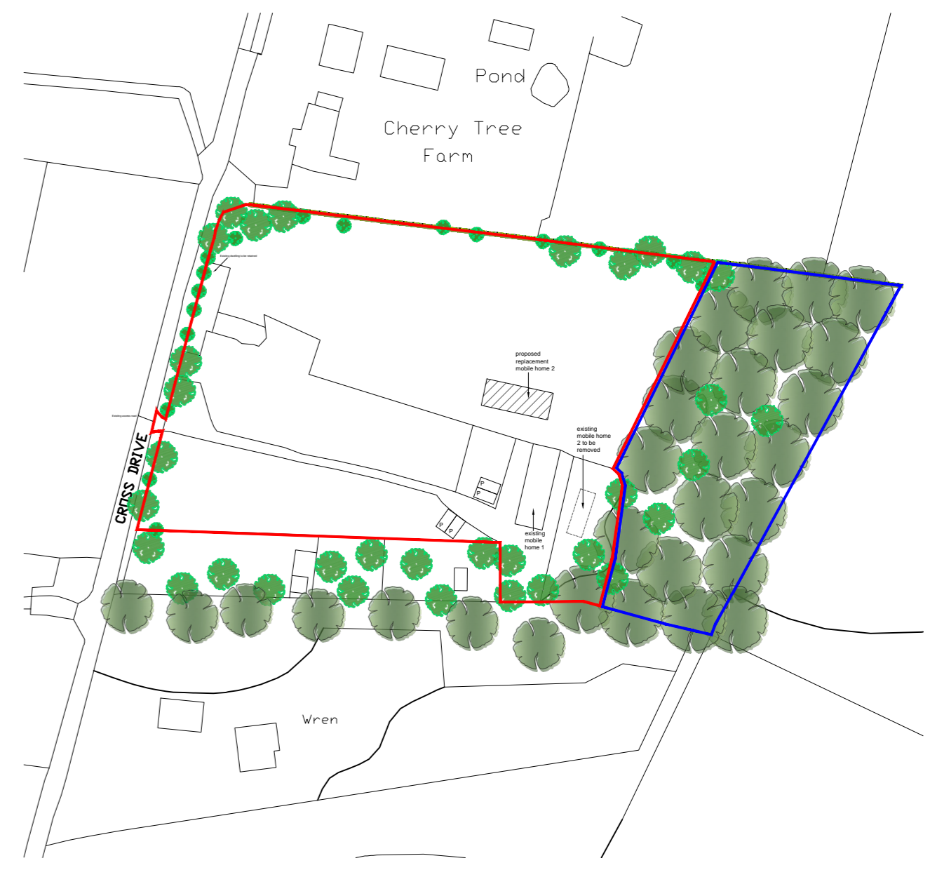
Location Plan 1:1250 @ A2