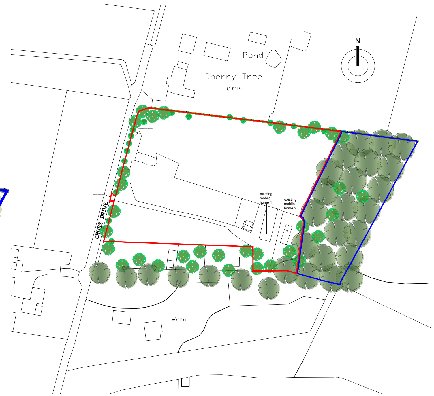
Location Plan 1:1250 @ A2