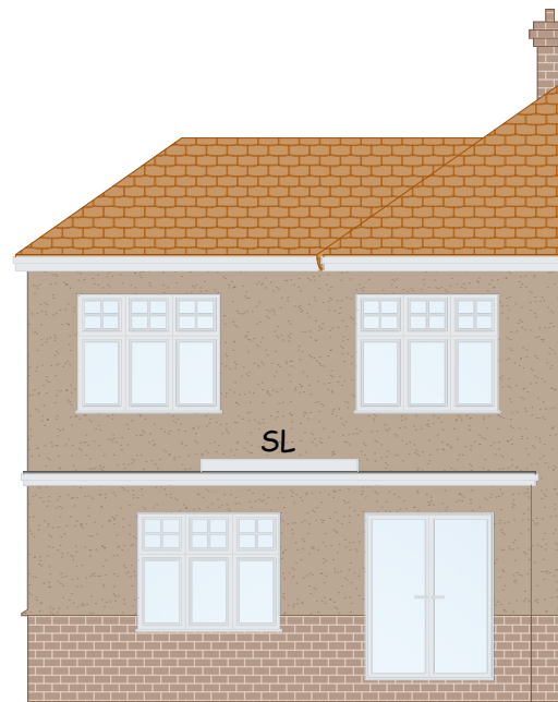
PROPOSED REAR ELEVATION (No Change Here )