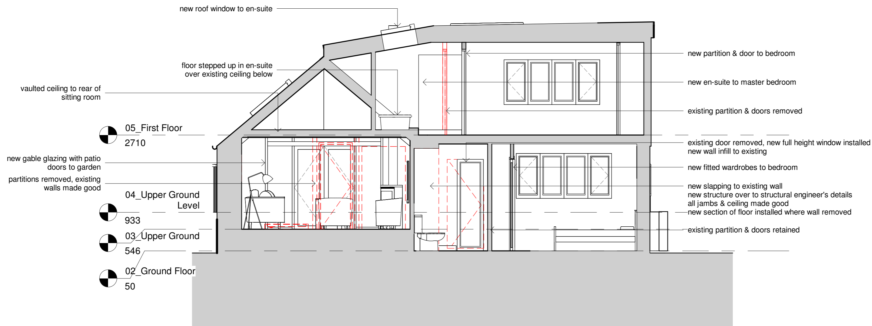
2 Proposed South-West Elevation 1 : 100