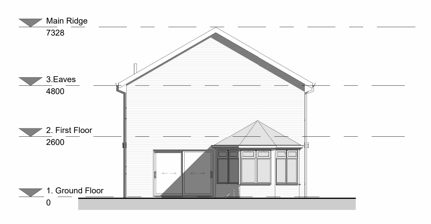
Side 2 (South West)