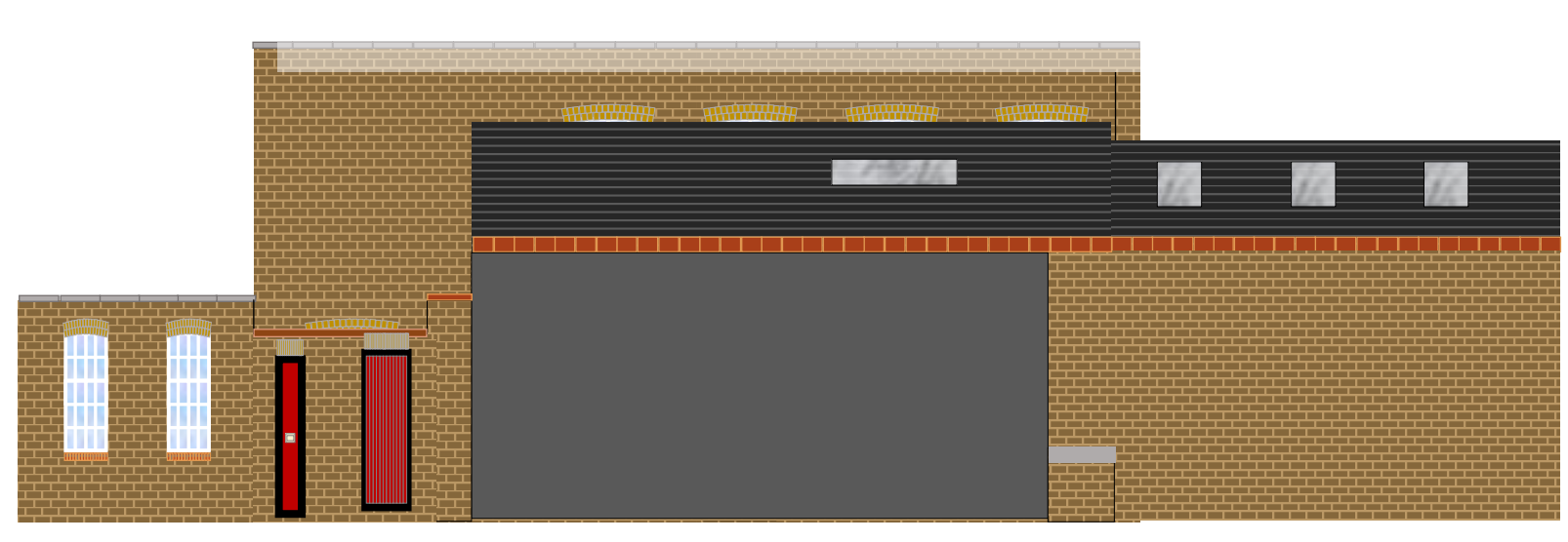
SIDE ELEVATION LOOKING WEST