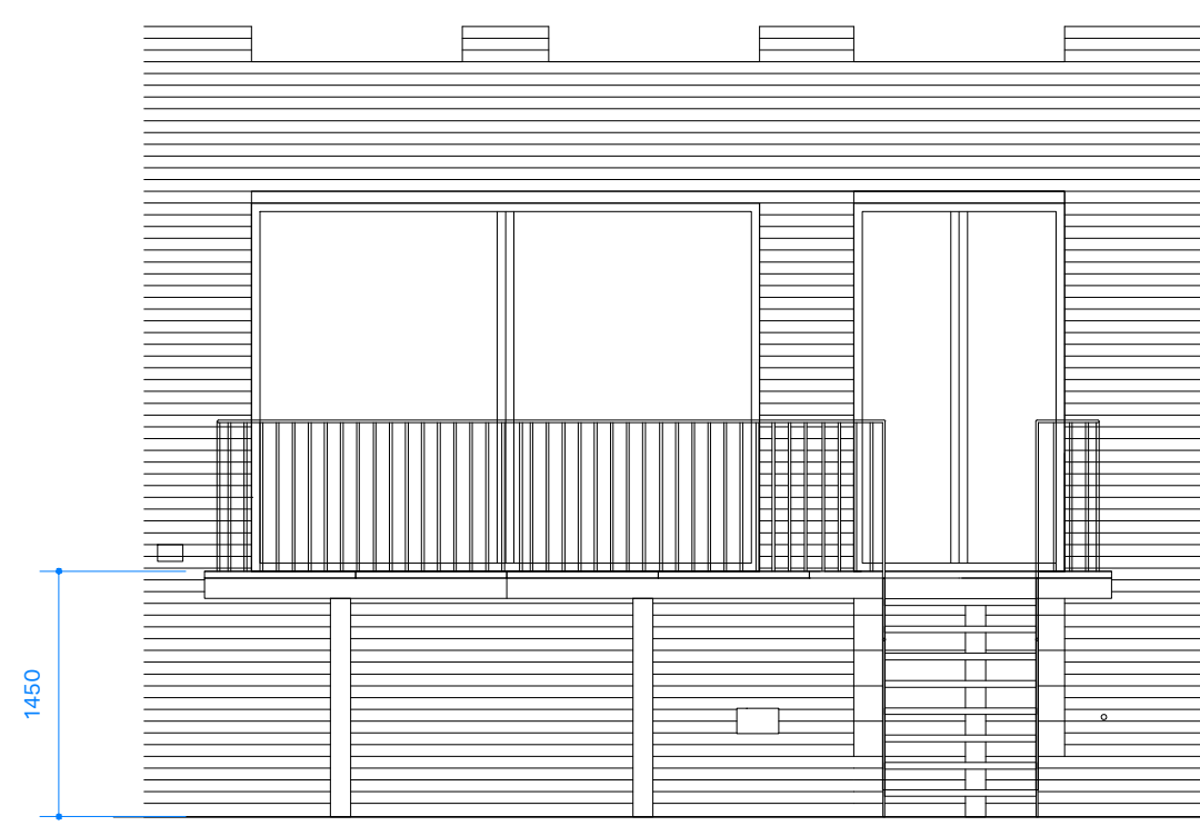
3 PROPOSED ELEVATION BB 1:50 / A3