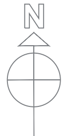
1:500 Block Plan