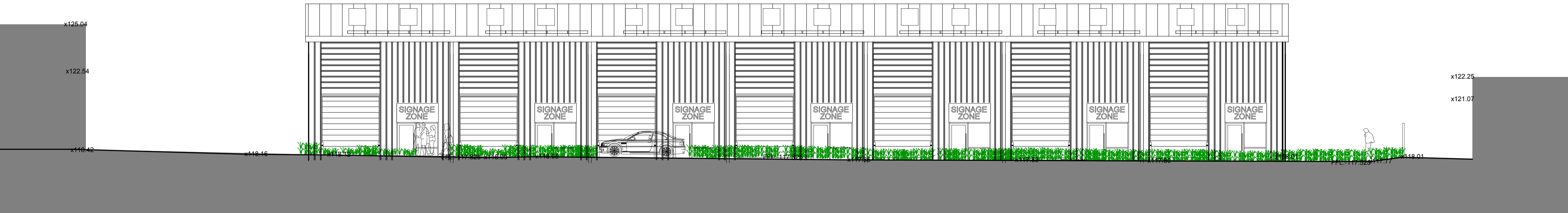
PROPOSED STREET ELEVATION - (NORTH ELEVATION) scale 1:100