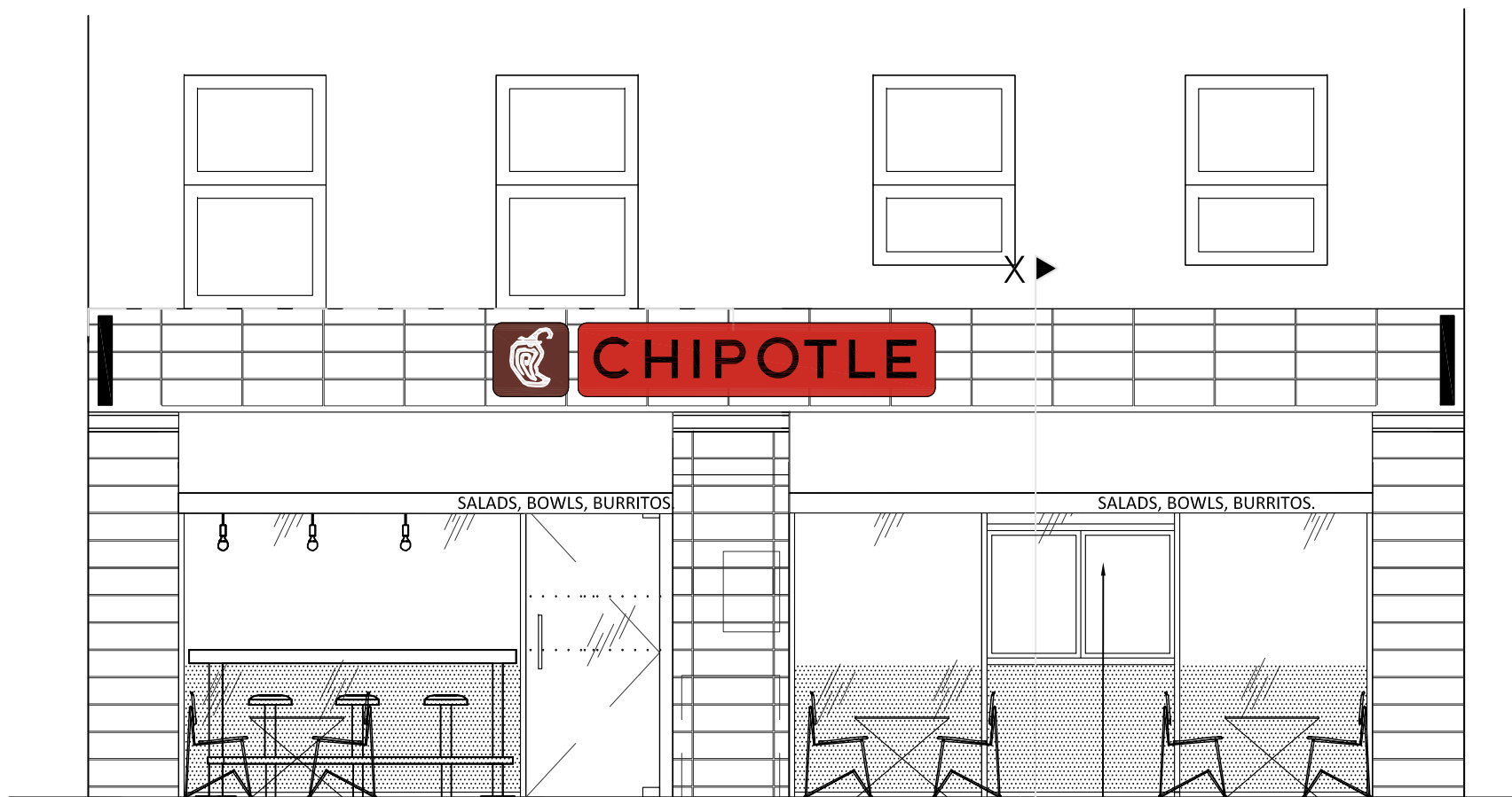
Proposed Ground Floor Elevation