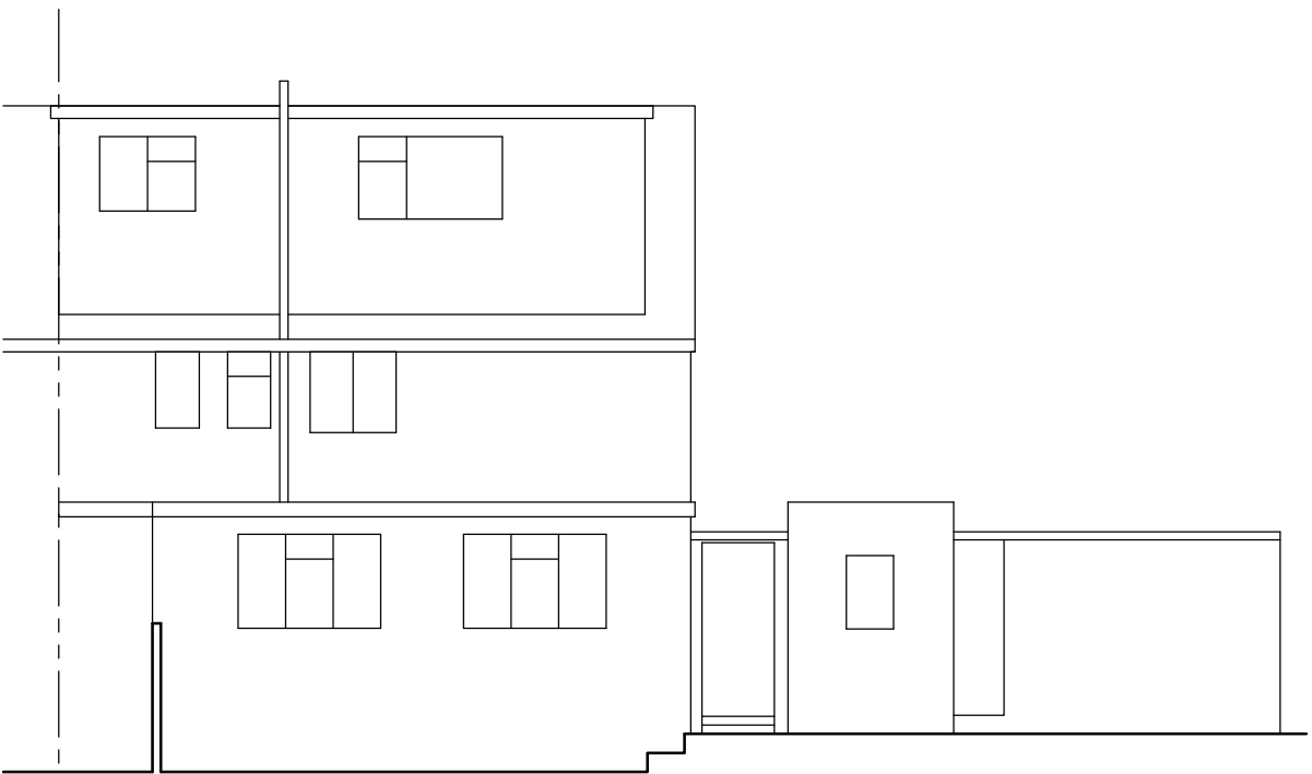
Rear (North) Elevation @ 1:100