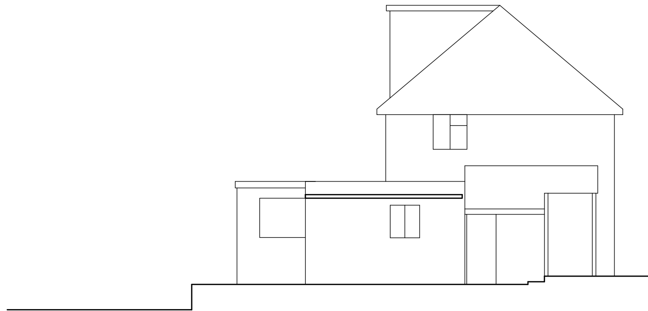
Side (West) Elevation @ 1:100