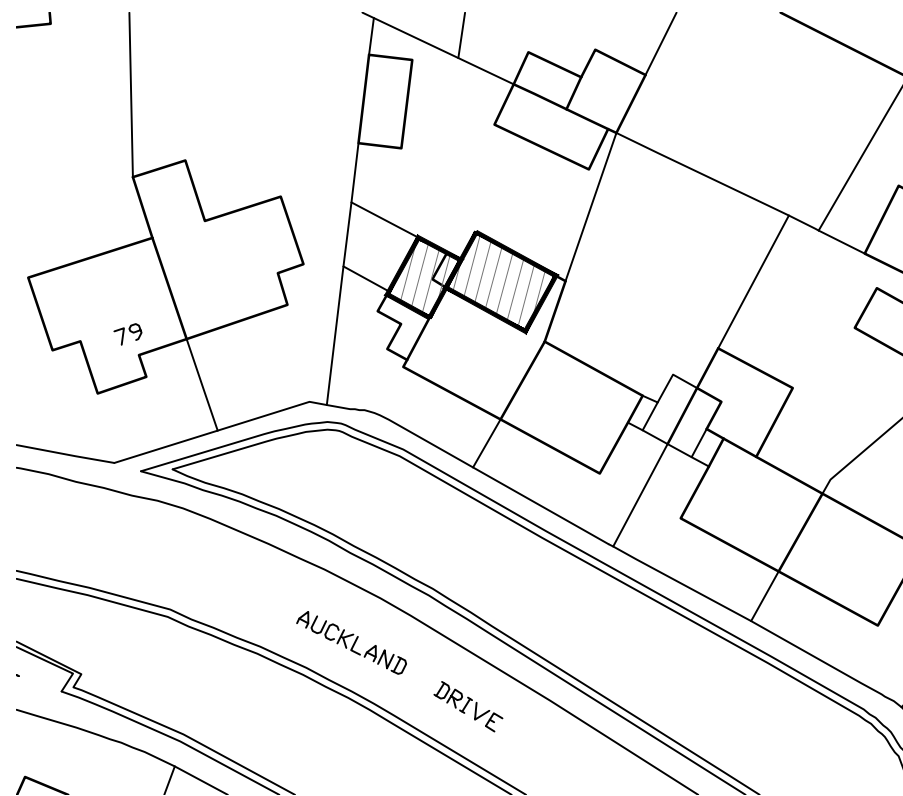
Block Plan @ 1:500 0 10 25m Scale 1:500