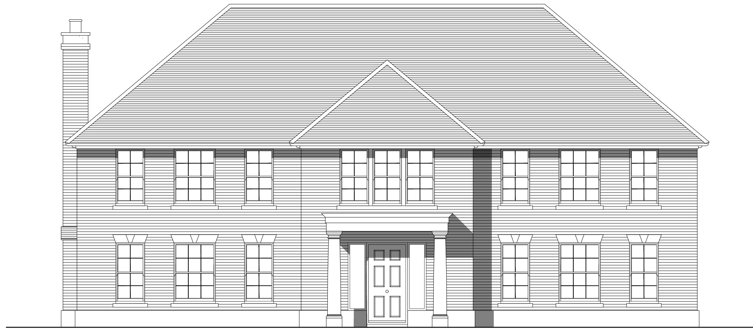
FRONT ELEVATION (EAST)