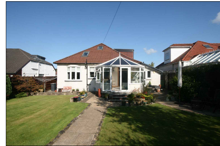
PHOTOGRAPH OF REAR

THEREFORE, AREA OF GARDEN THAT CAN BE DEVELOPED = 80.9m 2