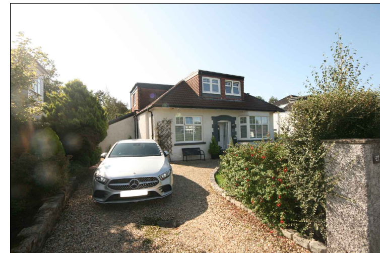
PHOTOGRAPH OF FRONT