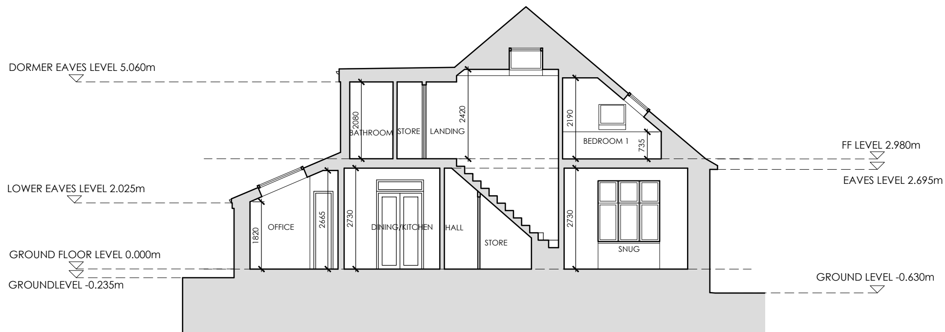
SECTION A-A AS EXISTING