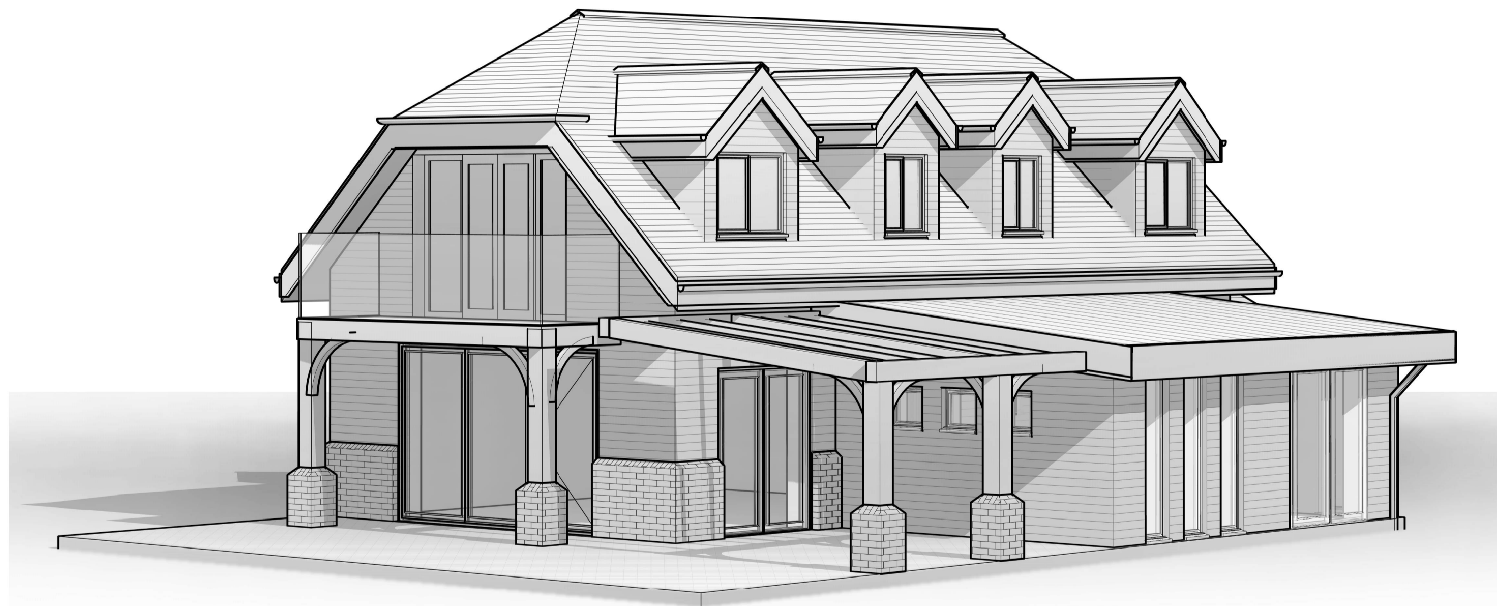
3D View South West