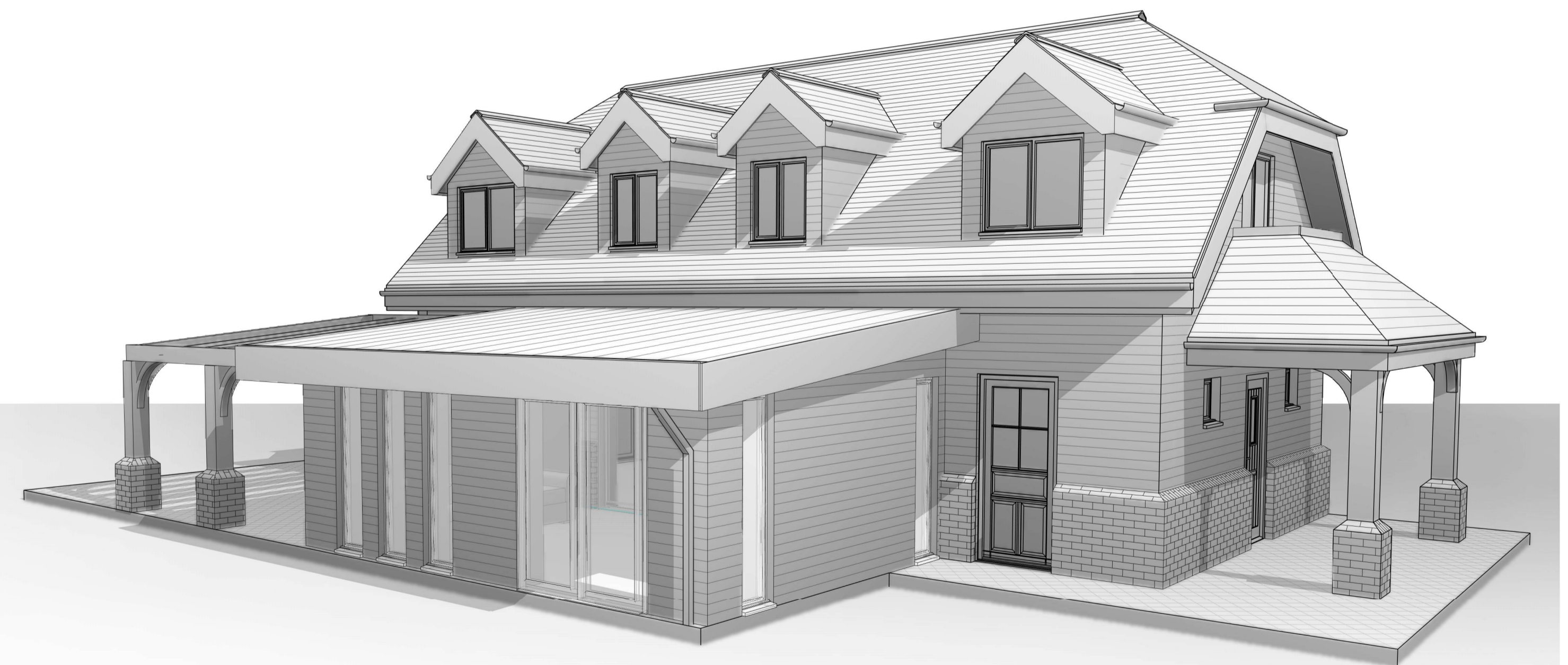
3D View South East