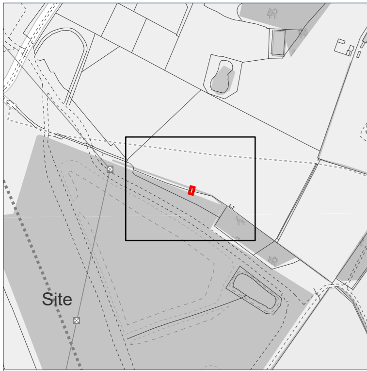
Location Plan Scale: 1:5000

The information contained in this document is confidential and protected by copyright. The use, copying or disclosure to a third party, either wholly or in part, except with the written permission of, and in the manner prescribed by Eiffage Kier constitutes an infringement of copyright. Dalcour Maclaren does not warrant that this document is definitive nor free of error and does not accept liability for any loss caused or arising from reliance upon information provided herein. Although our best efforts have been made to ensure the accuracy of these plans, all measurements must be confirmed on site. BASED UPON THE ORDNANCE SURVEY MAP WITH THE SANCTION OF THE CONTROLLER OF HM STATIONERY OFFICE. CROWN COPYRIGHT RESERVED. © OS LICENCE No. 100049190