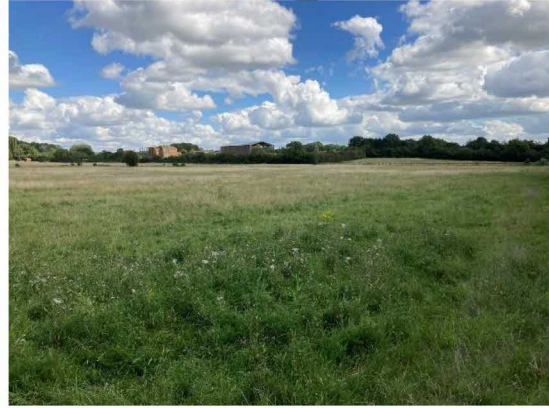
Photograph B – Modified grassland to the north of the Site