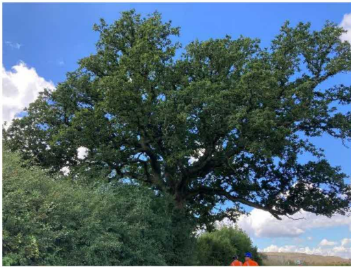
Photograph C – Mature oak tree (Target Note 1) within hedgerow.