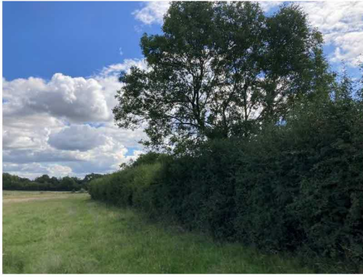
Photograph A – Hedgerow running through Site with ash tree (Target Note 2)