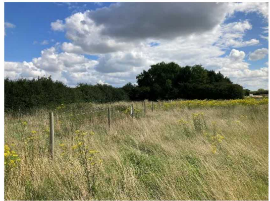
Photograph D – Modified grassland to the south of the Site with mixed scrub below hedgerow.