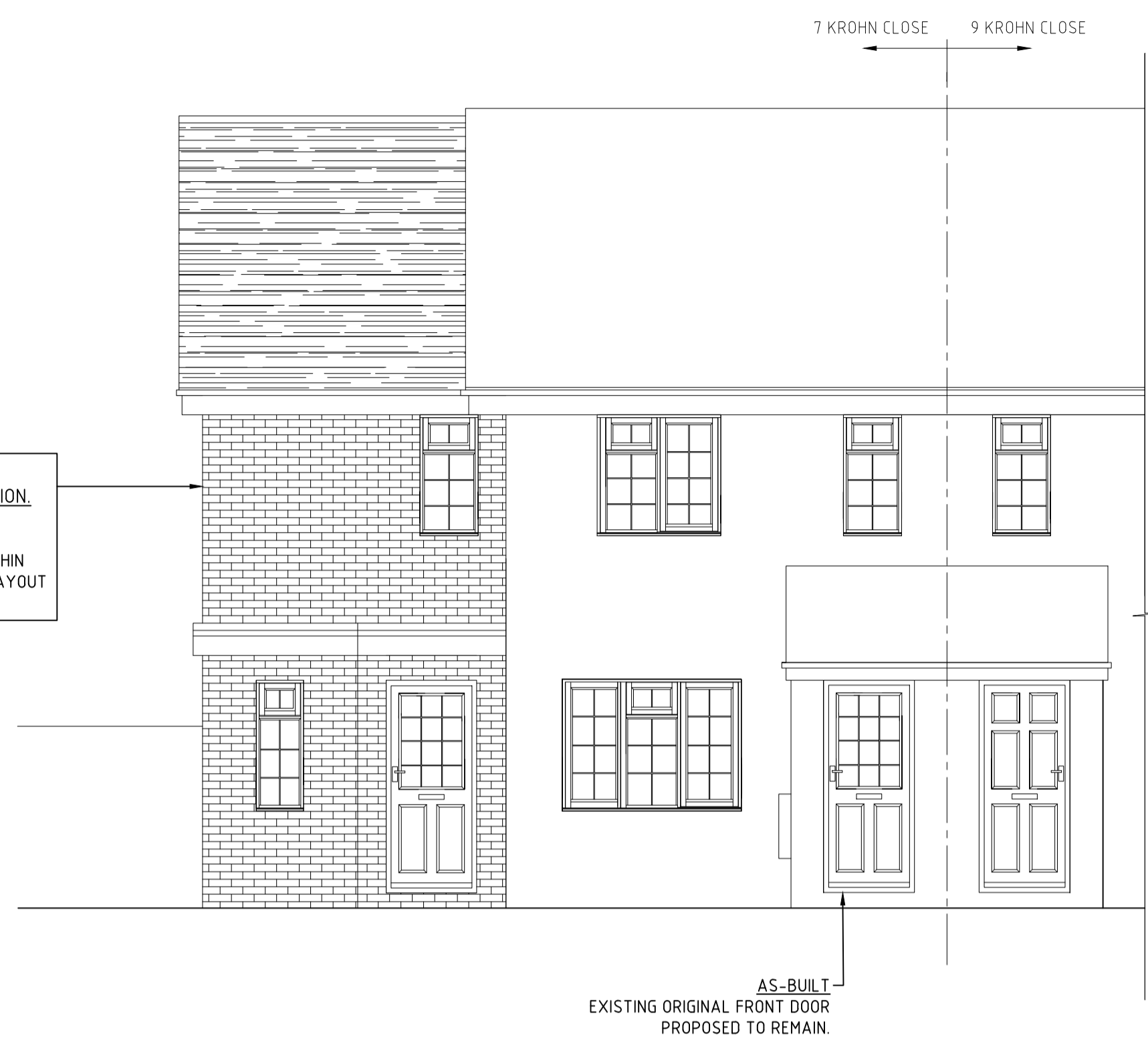
PROPOSED FRONT (1) ELEVATION (AS-BUILT) Scale 1:50

7 KROHN CLOSE, BUCKINGHAM RETROSPECTIVE HOUSEHOLDER PLANNING APPLICATION. - AMENDMENTS TO APPROVED PLANNING APPLICATION 20/01018/APP TO INCLUDE ANNEXE ACCOMMODATION WITHIN ERECTED TWO-STOREY EXTENSION AND REVISIONS TO LAYOUT AND EXTERNAL DOOR/WINDOWS.