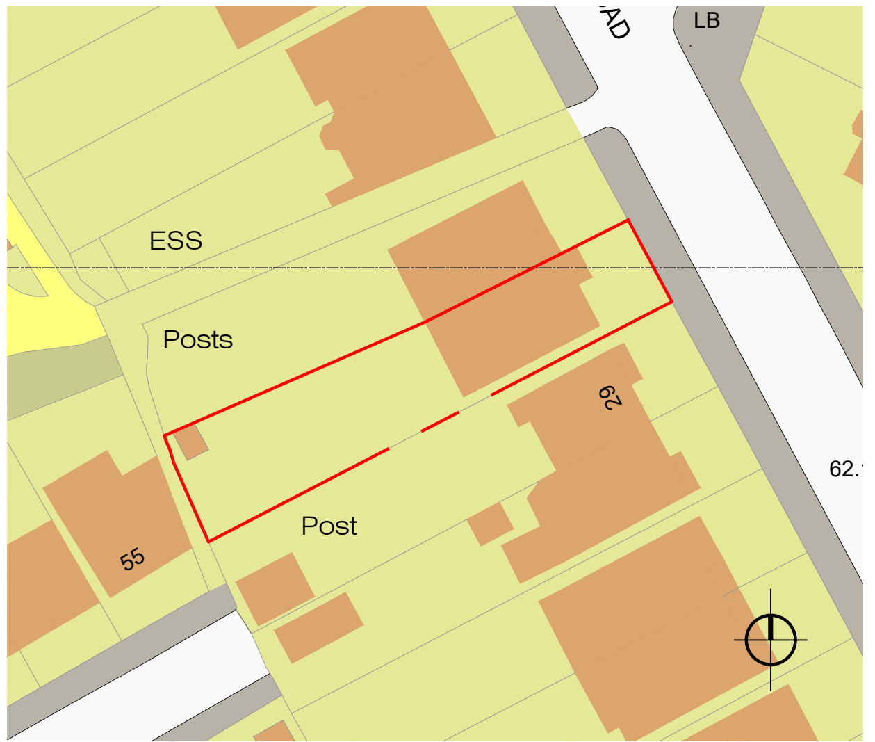
02 Block Plan scale: 1:500