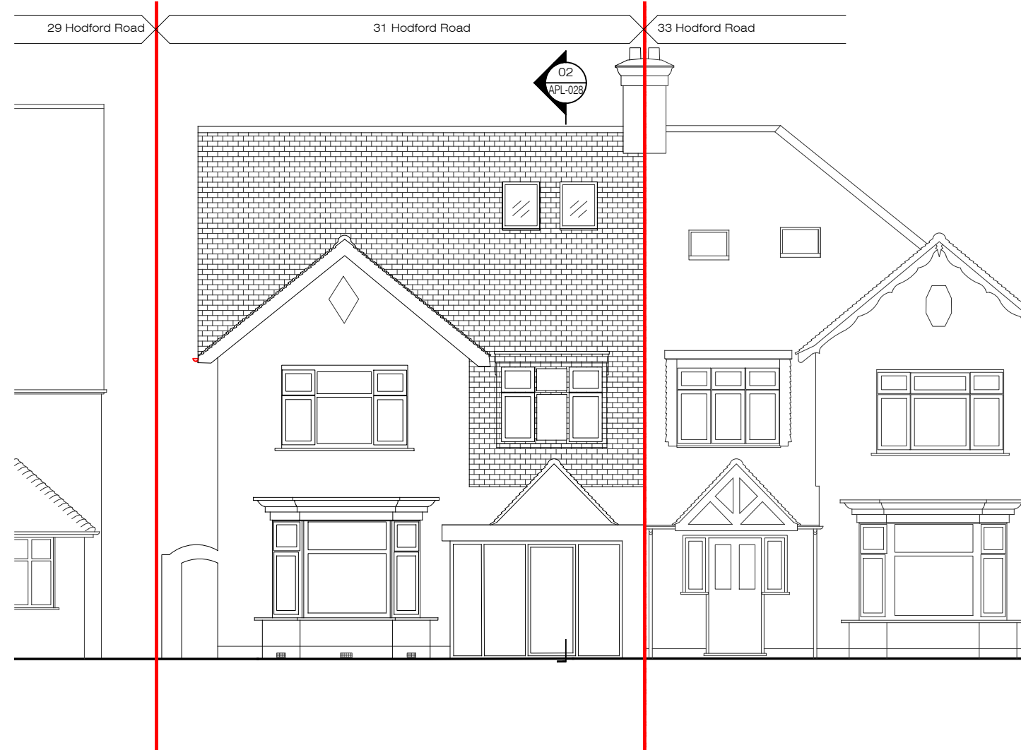
01 Front Elevation scale: 1:100