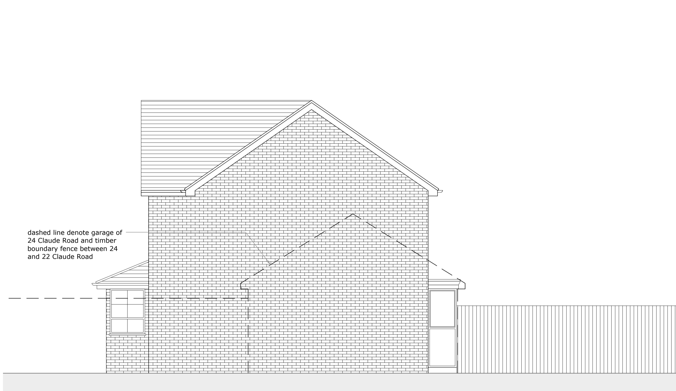
side elevation (south east facing) as existing 1:50