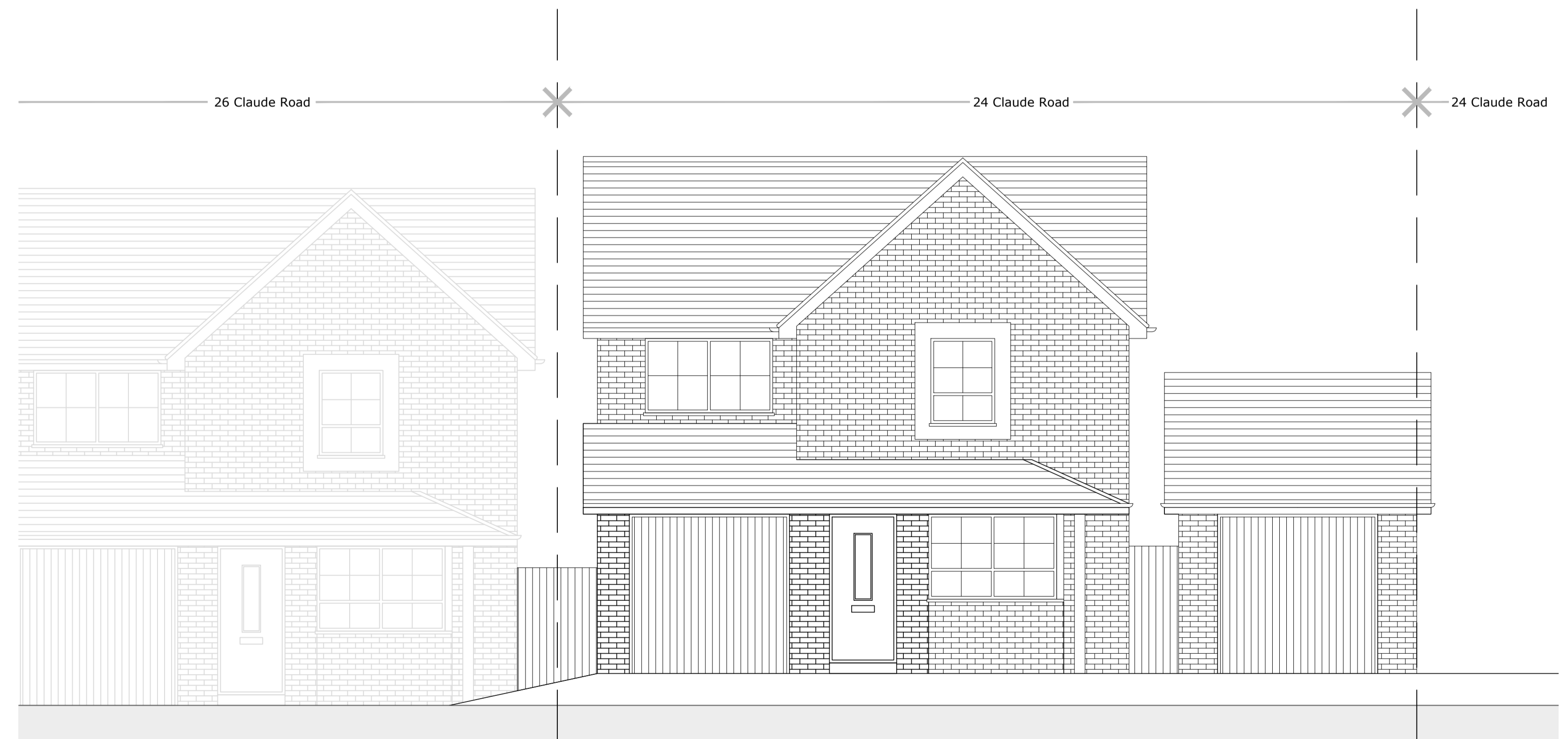
front elevation (south west facing) as existing 1:50