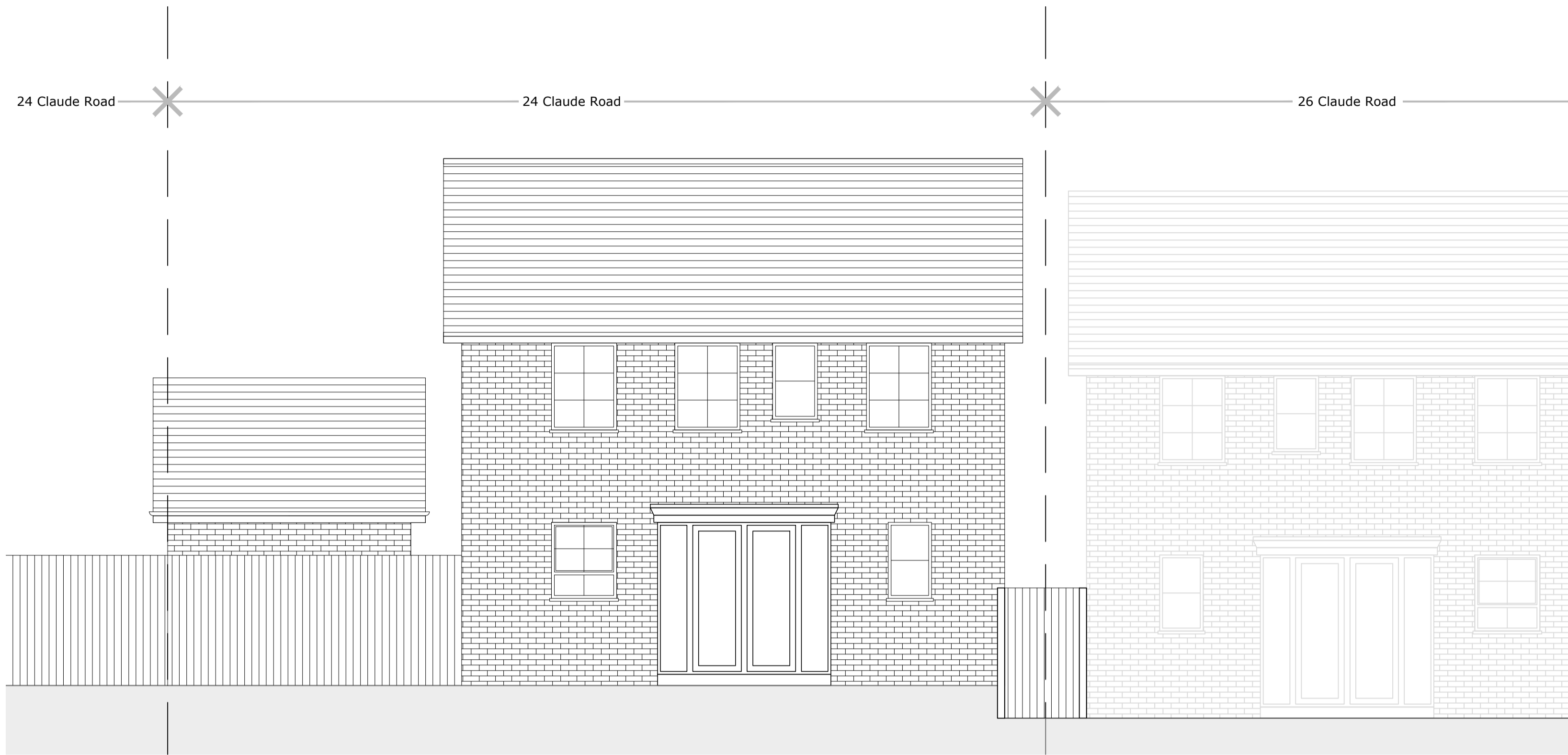
rear elevation (north east facing) as existing 1:50