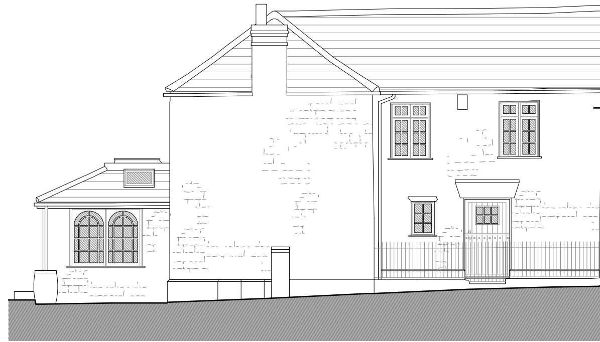
House West Elevation